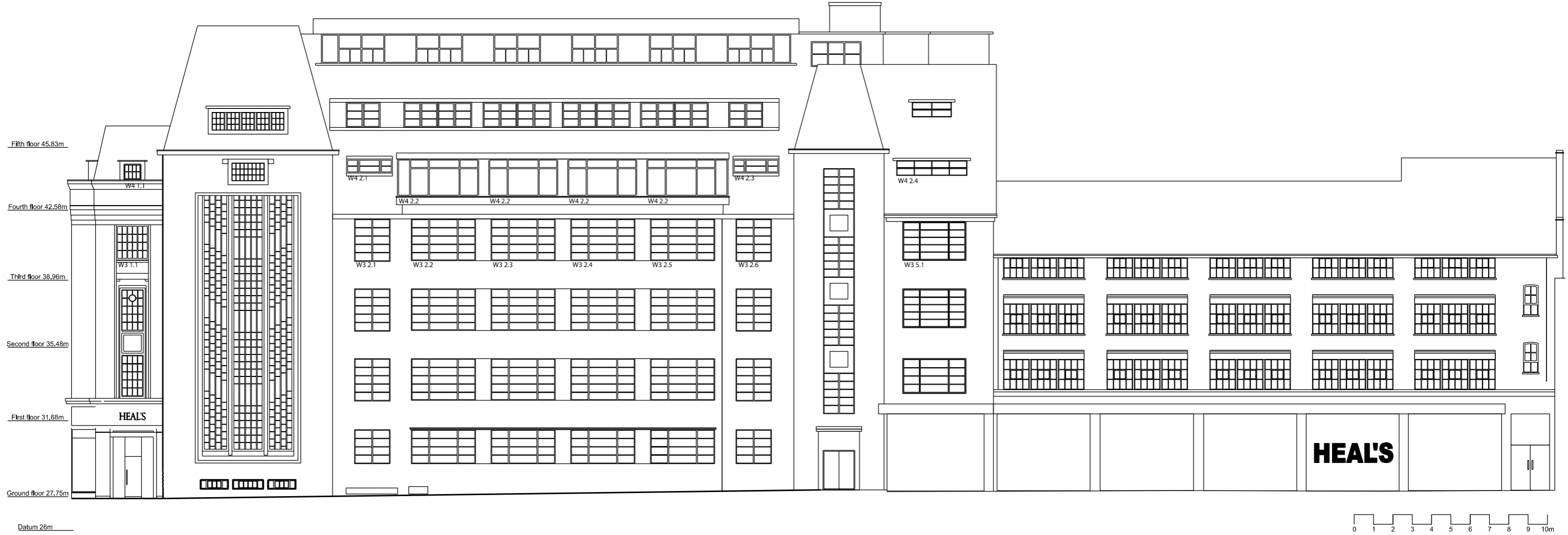
Section A - Alfred Mews Elevation