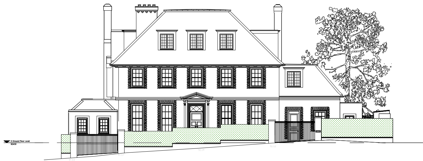
Street view elevation showing front boundary gates and hedging