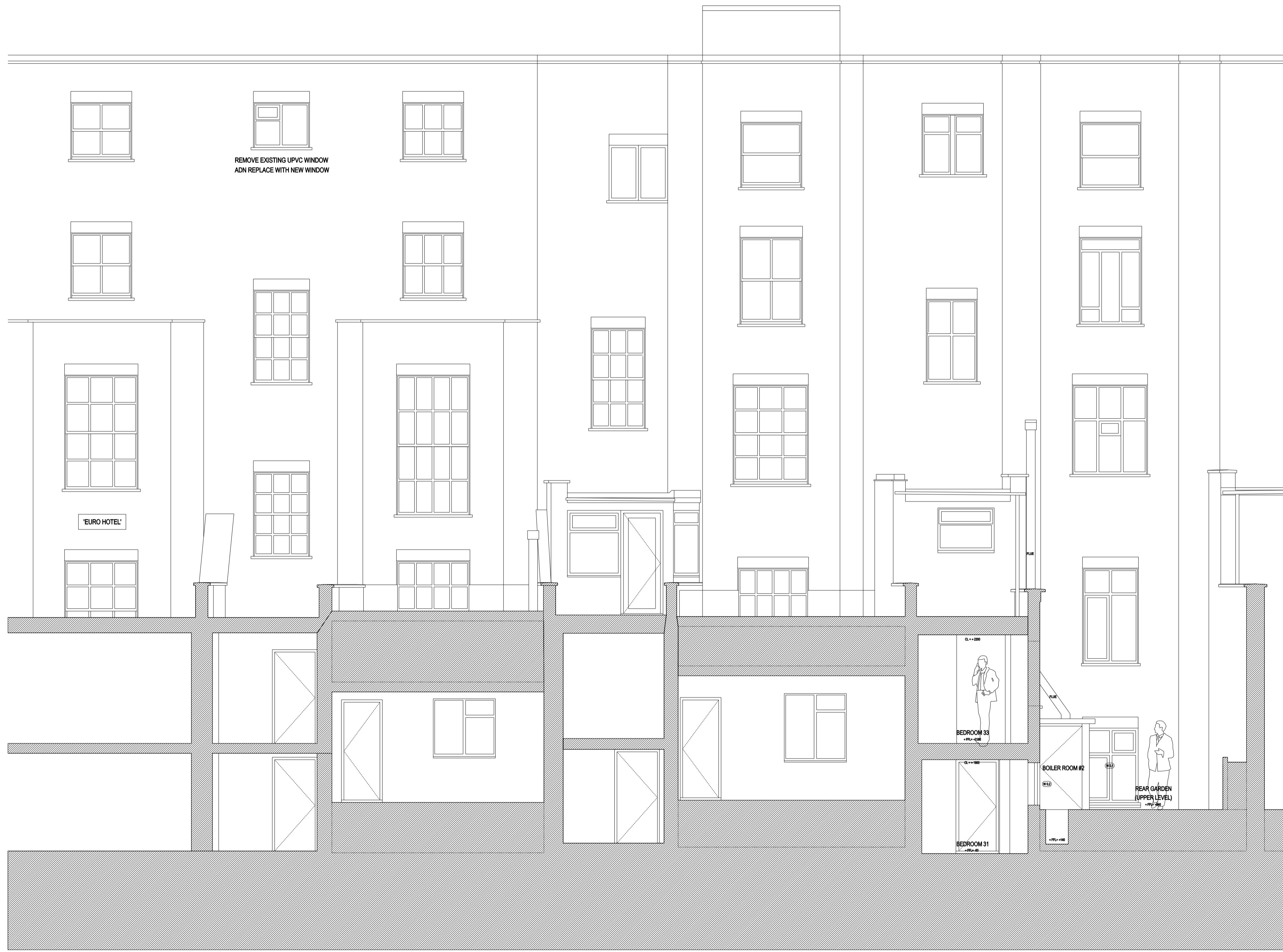
01 EXISTING REAR ELEVATION 01 Scale 1:50 @ A1 SIZE / 1:100 @ A3 SIZE