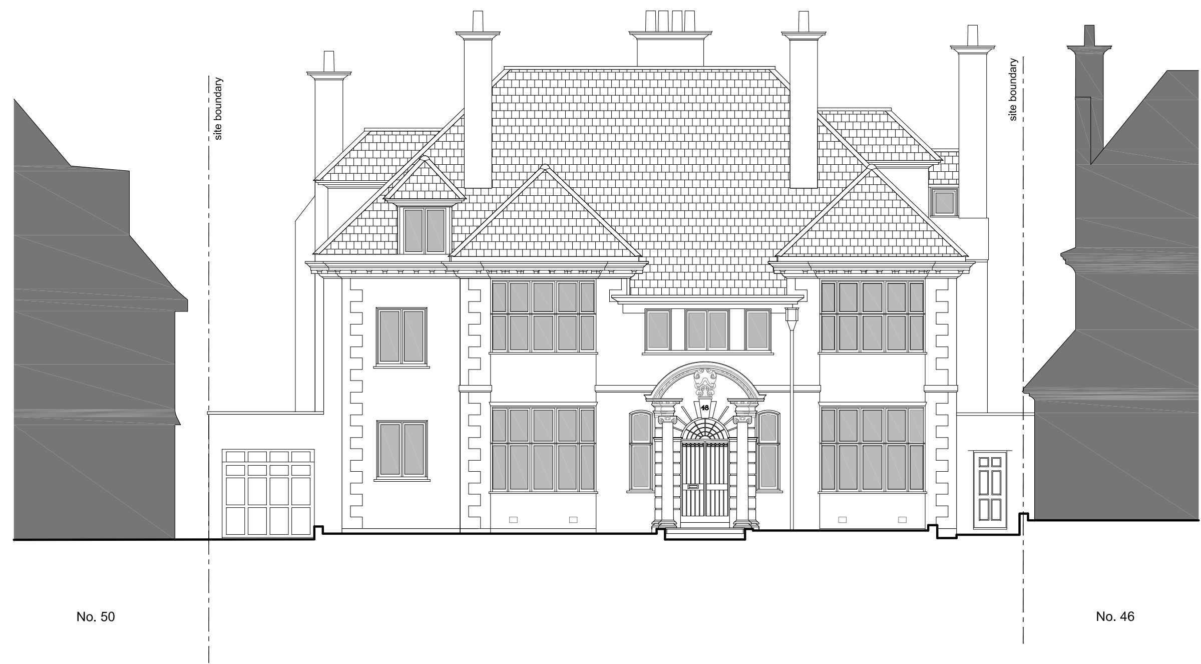
Proposed Front Elevation Scale 1:50 @A1