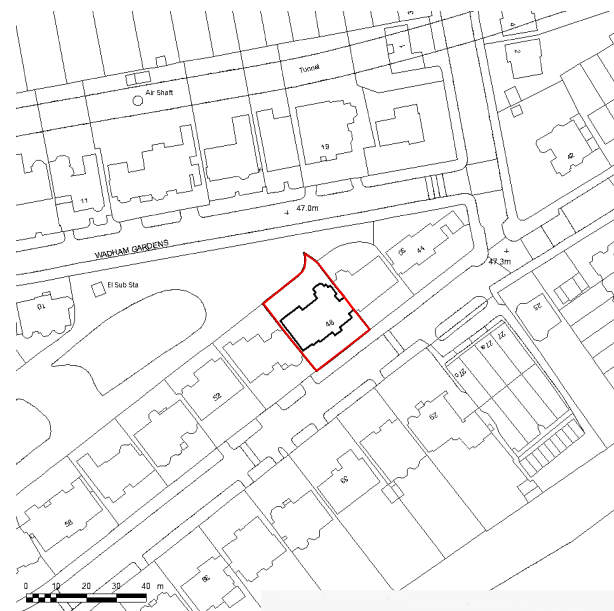
Site Plan Scale 1: 1250 @ A1 1: 2500 @ A3