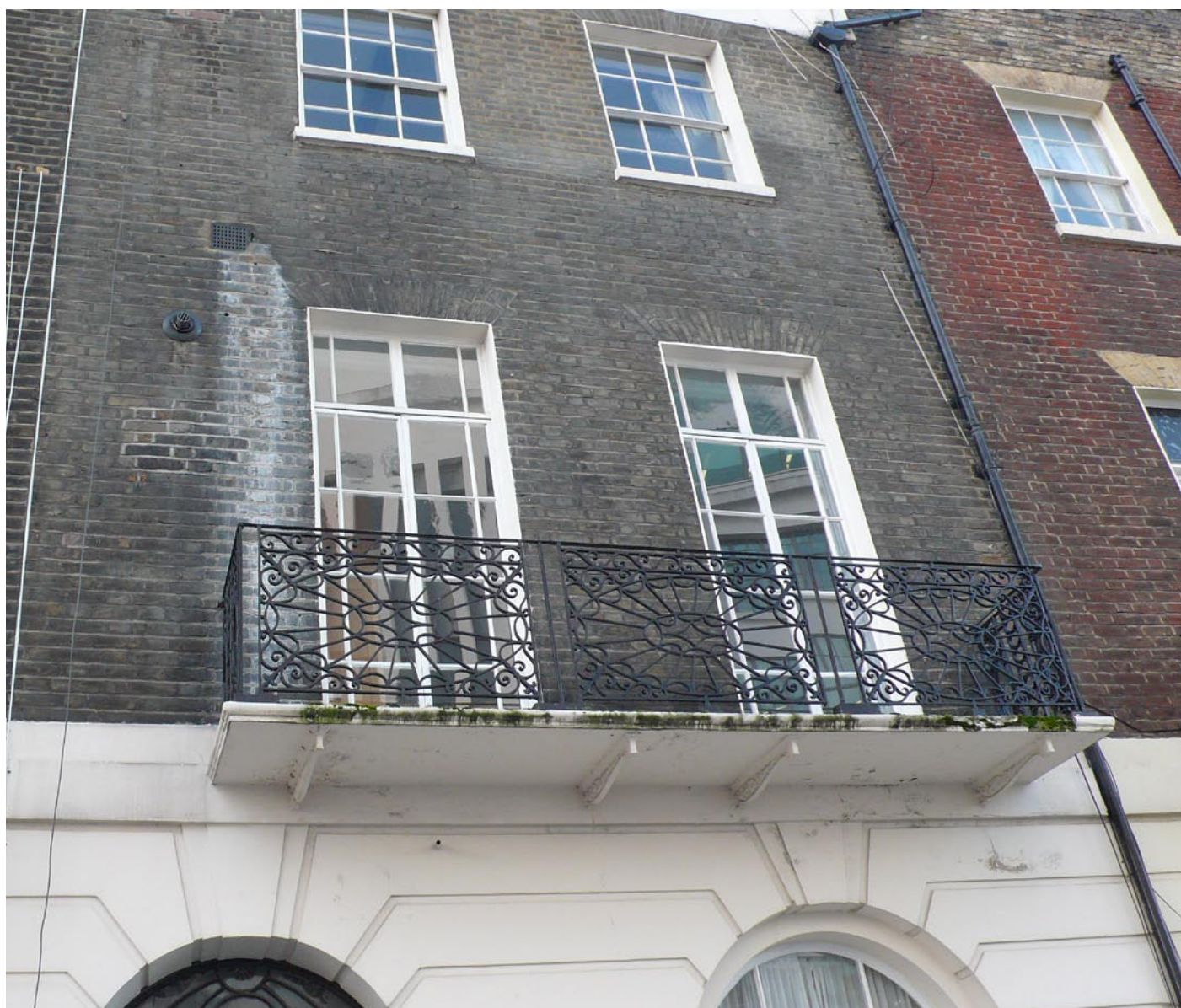
Existing York stone balcony.

The intent is that the balcony is replaced with York stone to match the existing and that the balustrade and brackets are to be repaired.