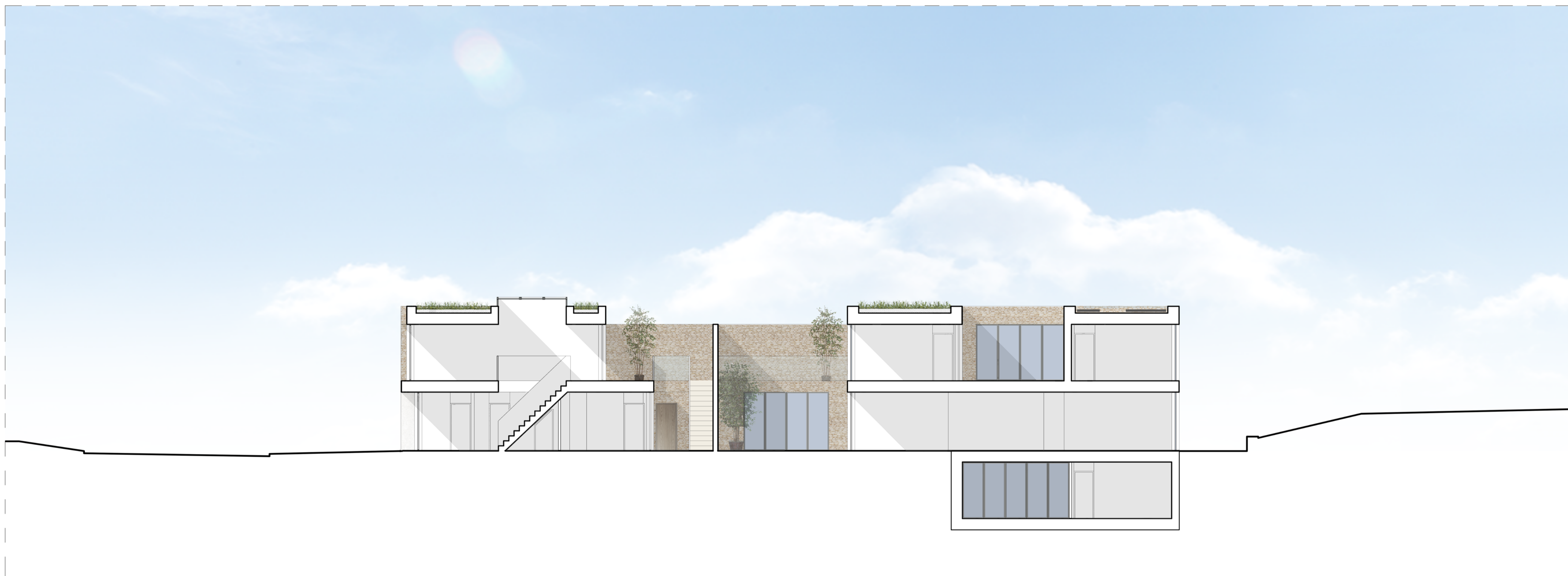
02 Section DD