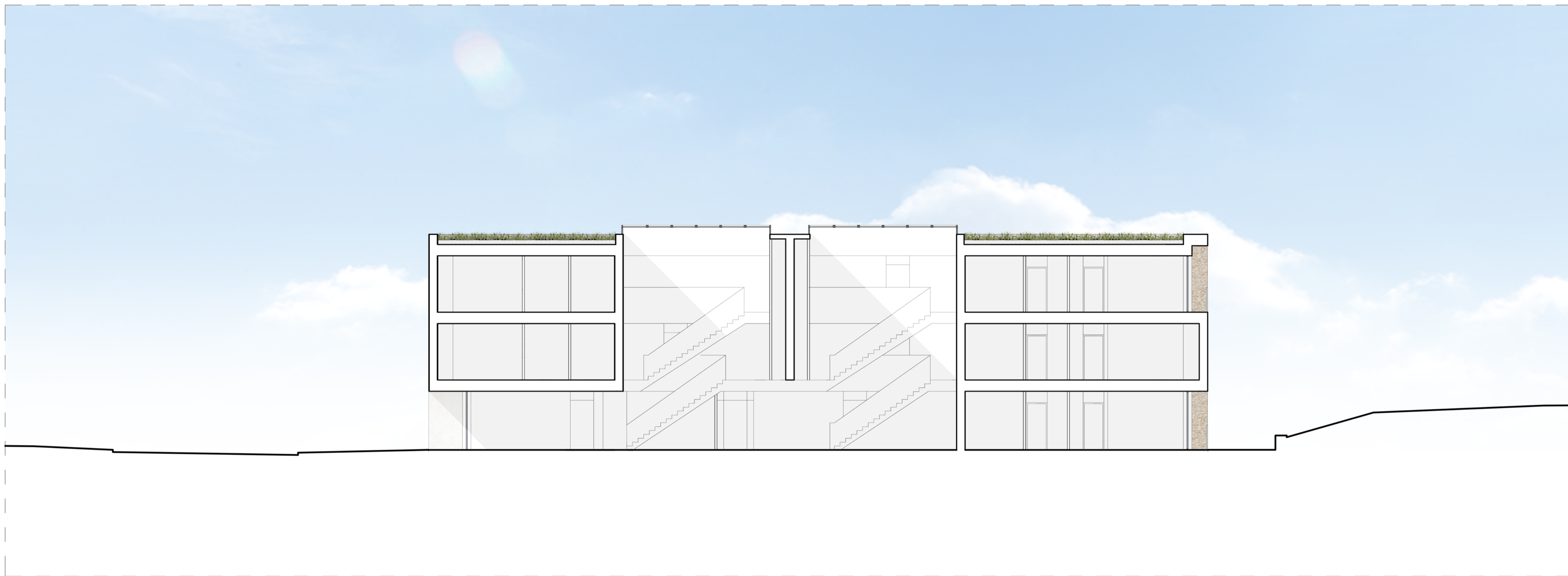
01 Section CC