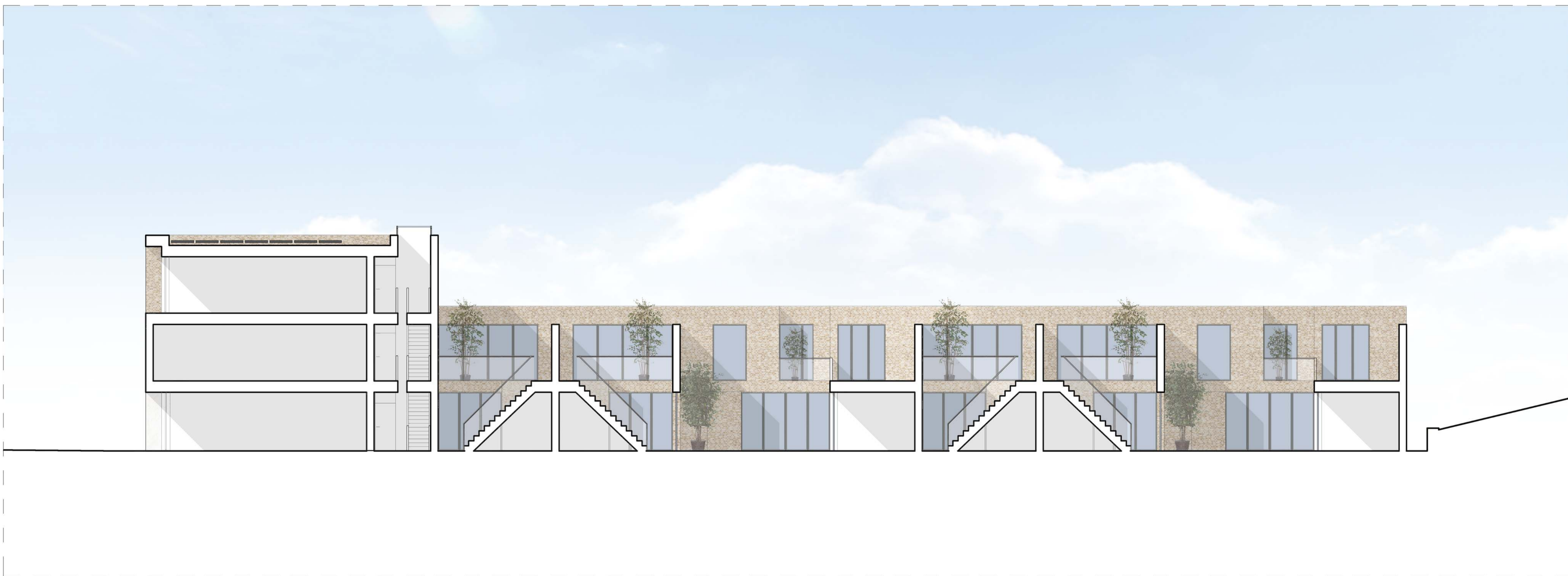
02 Section BB