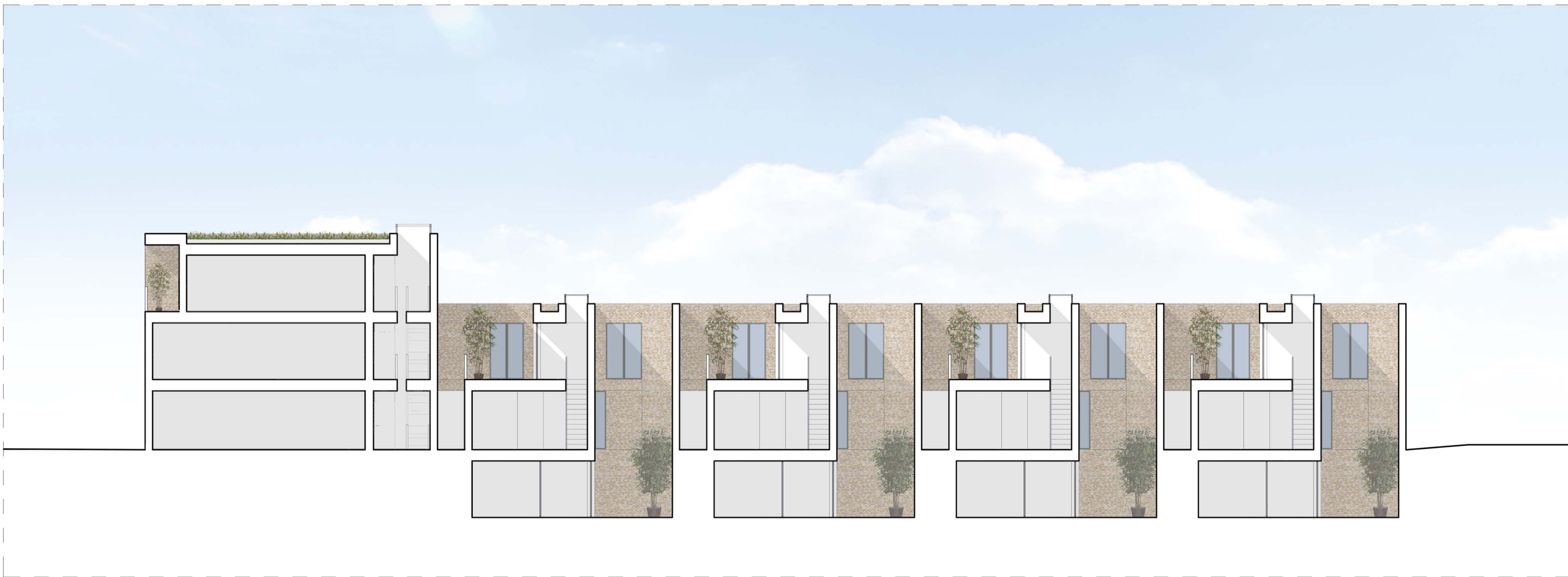
01 Section AA