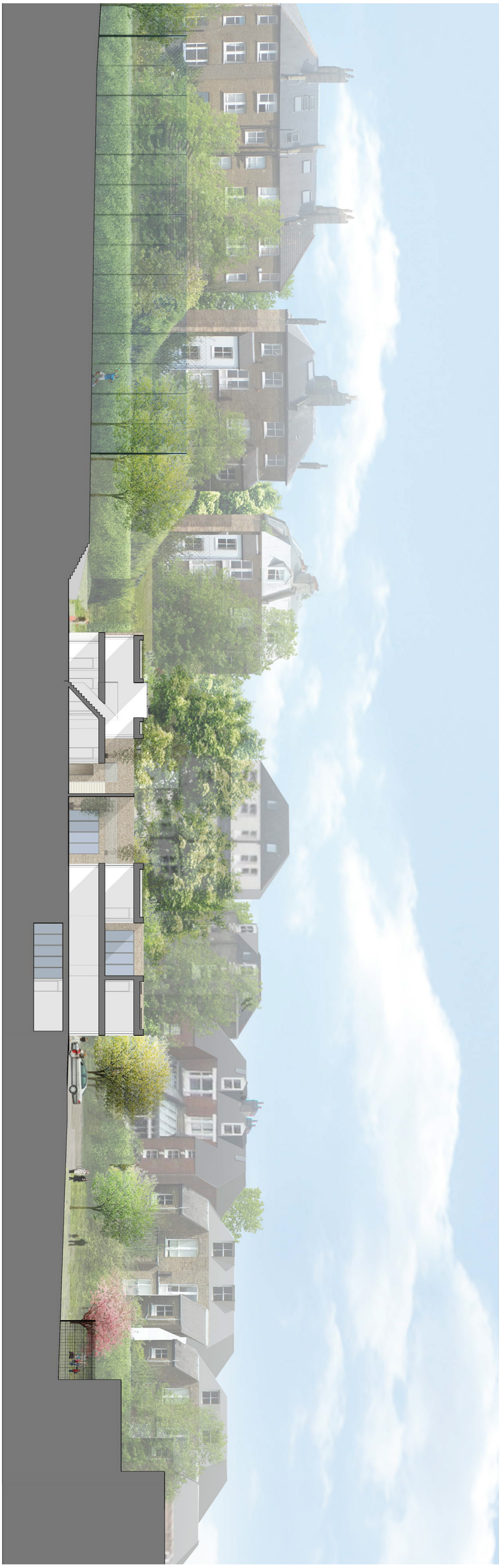
01 Site Section EE