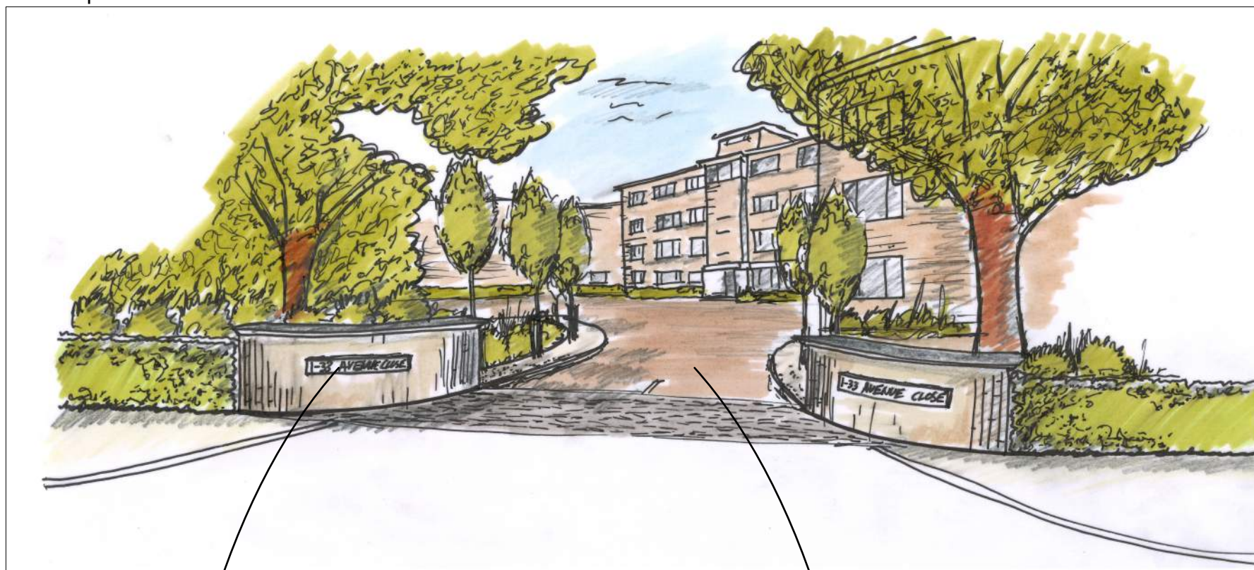
Proposed elevation of walls