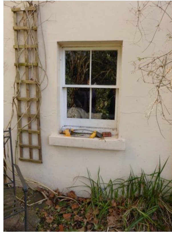
C Window detail