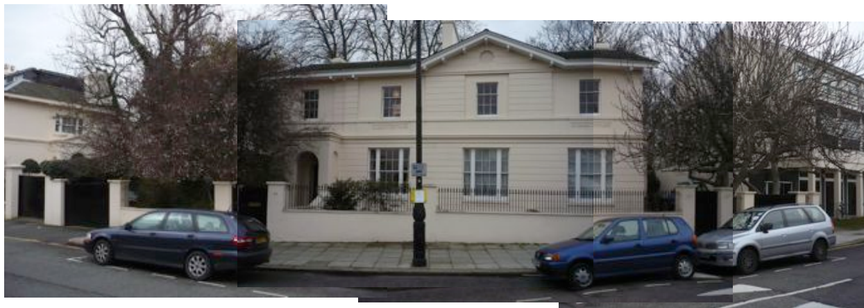
B Street elevation

The rear elevation retains few details at garden level.