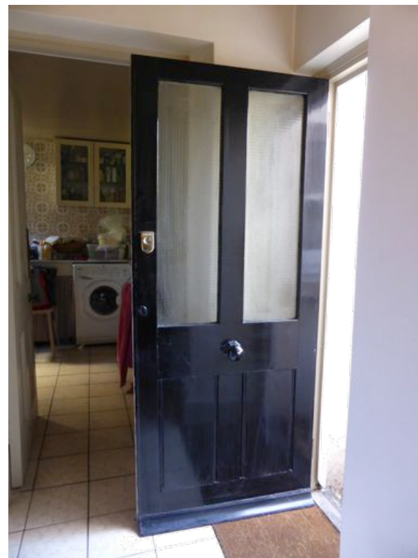
D Existing door detail