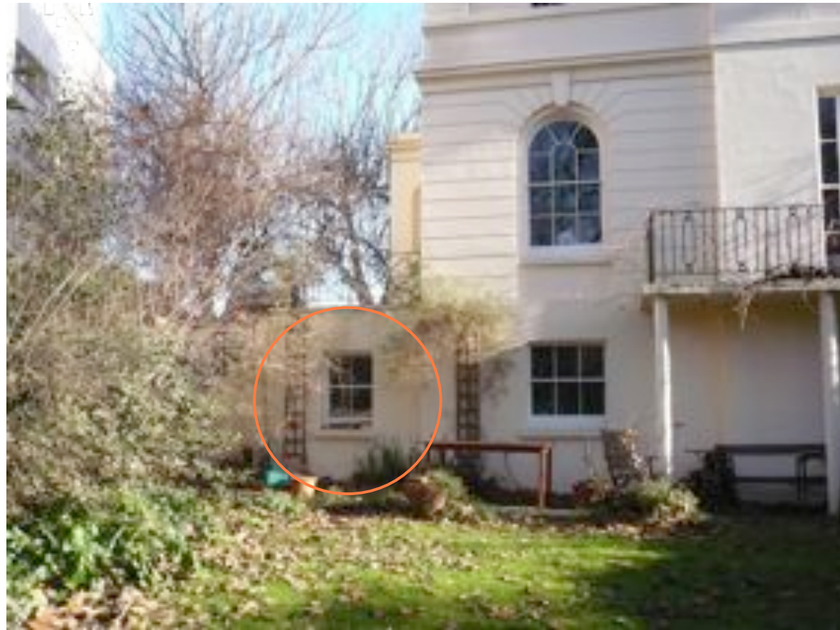
A Garden elevation