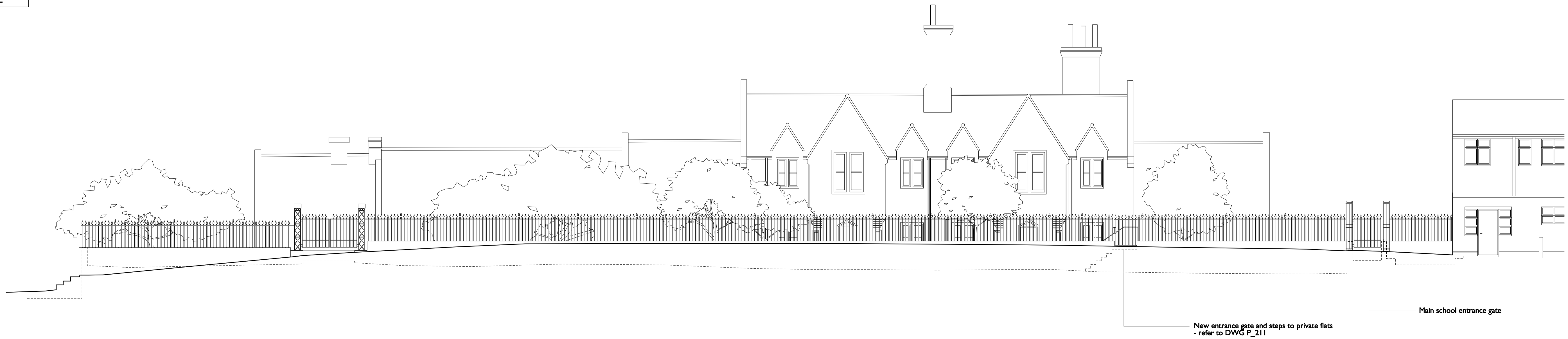
1 Elevation 4-4 P_121 Scale 1:100

Project CHRIST CHURCH PRIMARY SCHOOL Christchurch Hill, London NW3 1JH Drawing Title