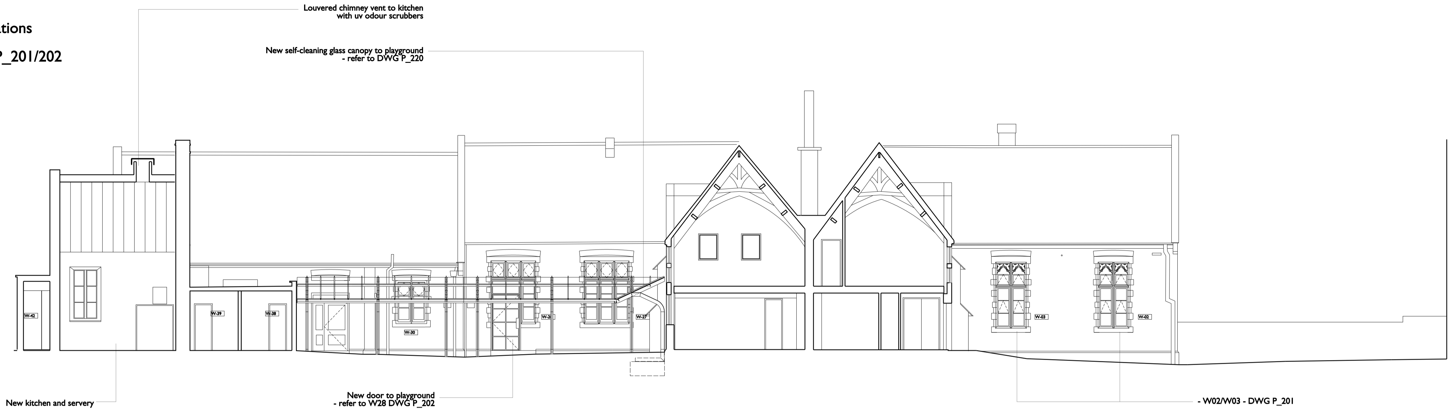
3 Section 6-6 P_121 Scale 1:100

Note: - for Window refurbishment and alterations to windows read in conjunction with Window Schedule P_200 and DWGs P_201/202