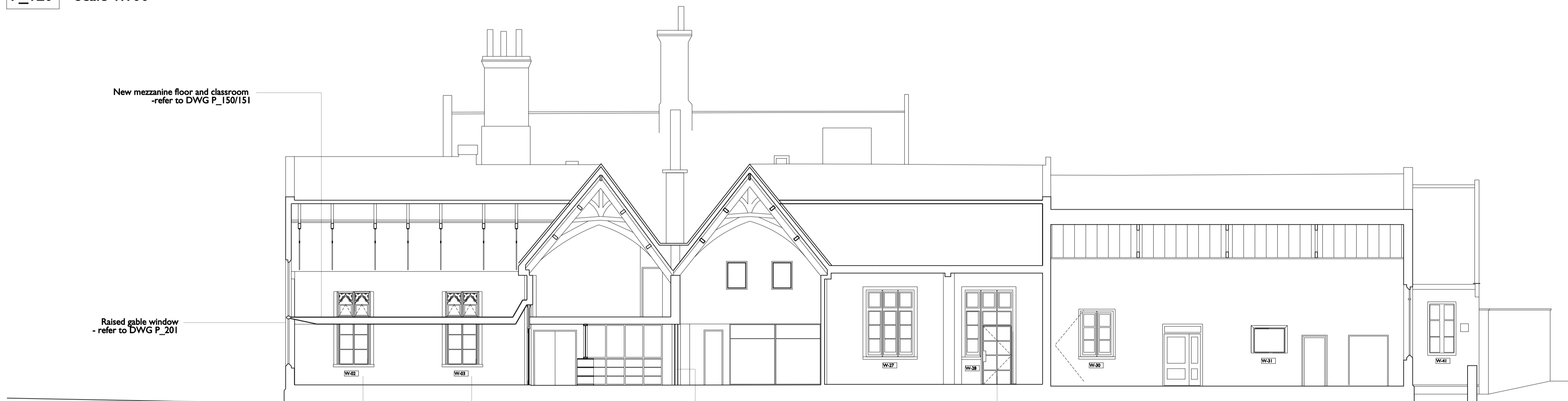
2 Section 2-2 P_120 Scale 1:100