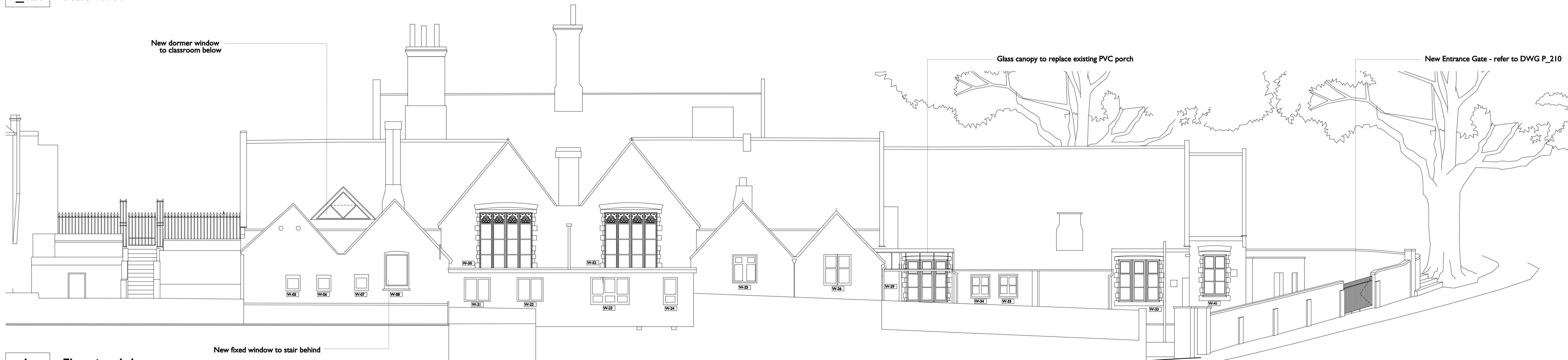
1 Elevation 1-1 P_120 Scale 1:100

STUDIO SCULLINAN AND CABEL ARCHITECTS LTD. © 25 Hatton Garden London EC1N 8BQ UK t: +44 (0) 20 7033 8788 e: team@scabal.net