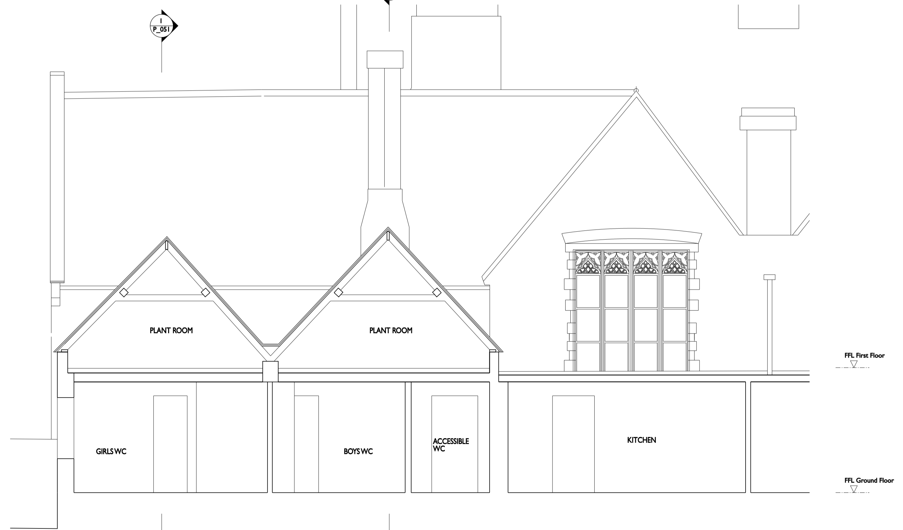
4 Section R-R P_051 Scale 1:50