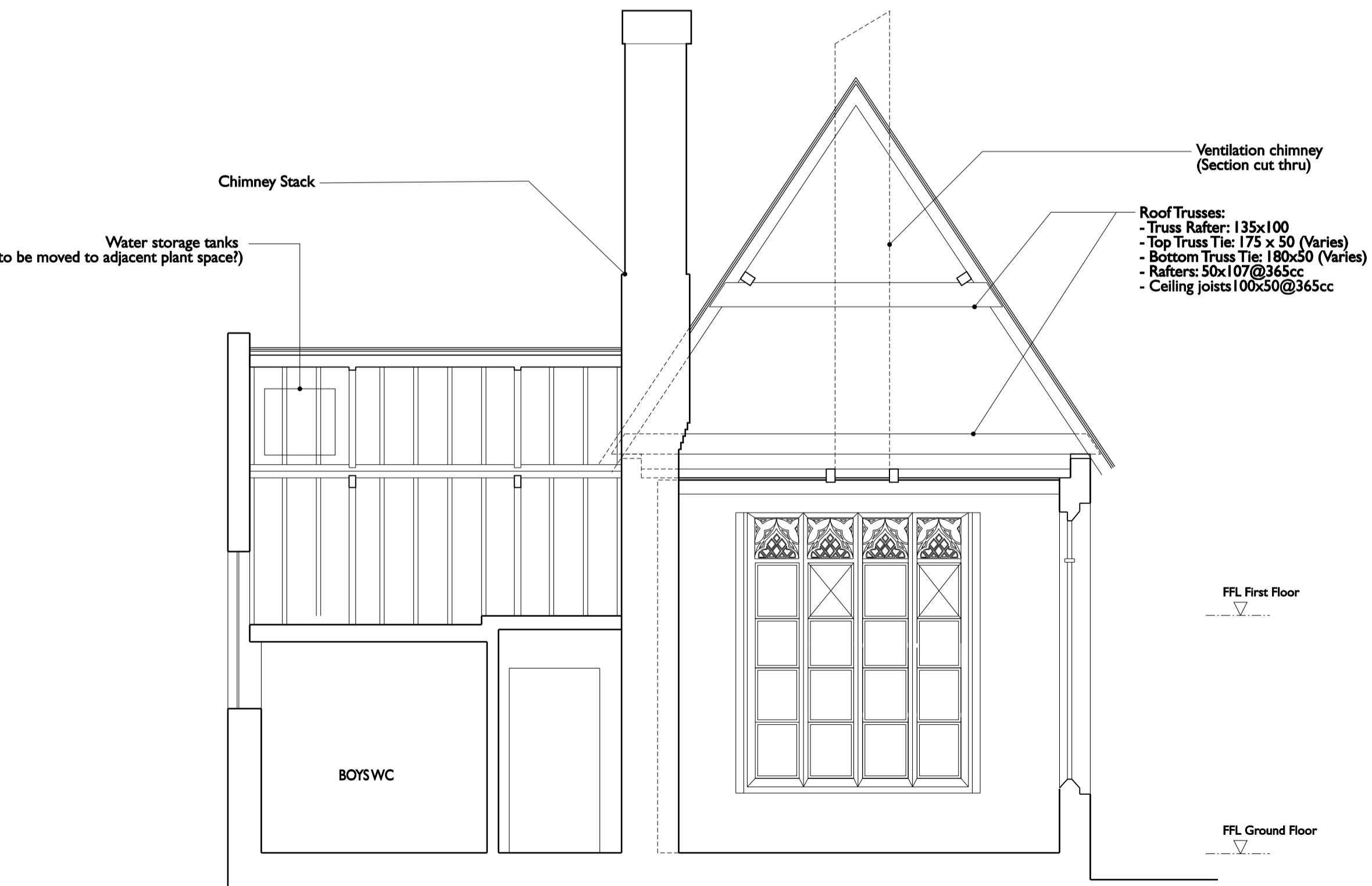
2 Section P-P P_051 Scale 1:50