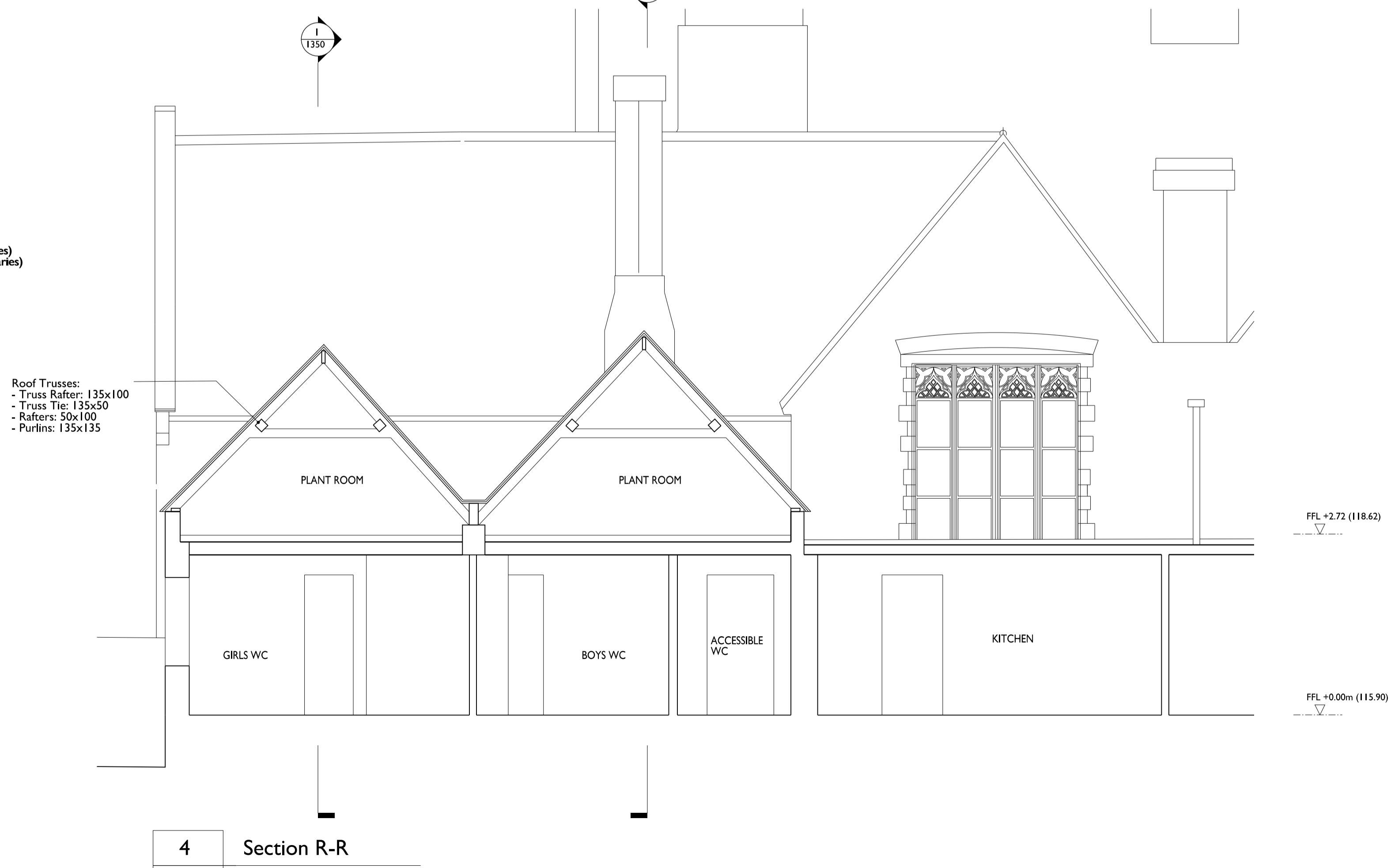
4 Section R-R 1350 Scale 1:50/100

25 Hatton Garden London EC1N 8BQ UK t: +44 (0) 20 7033 8788 e: team@scabal.net