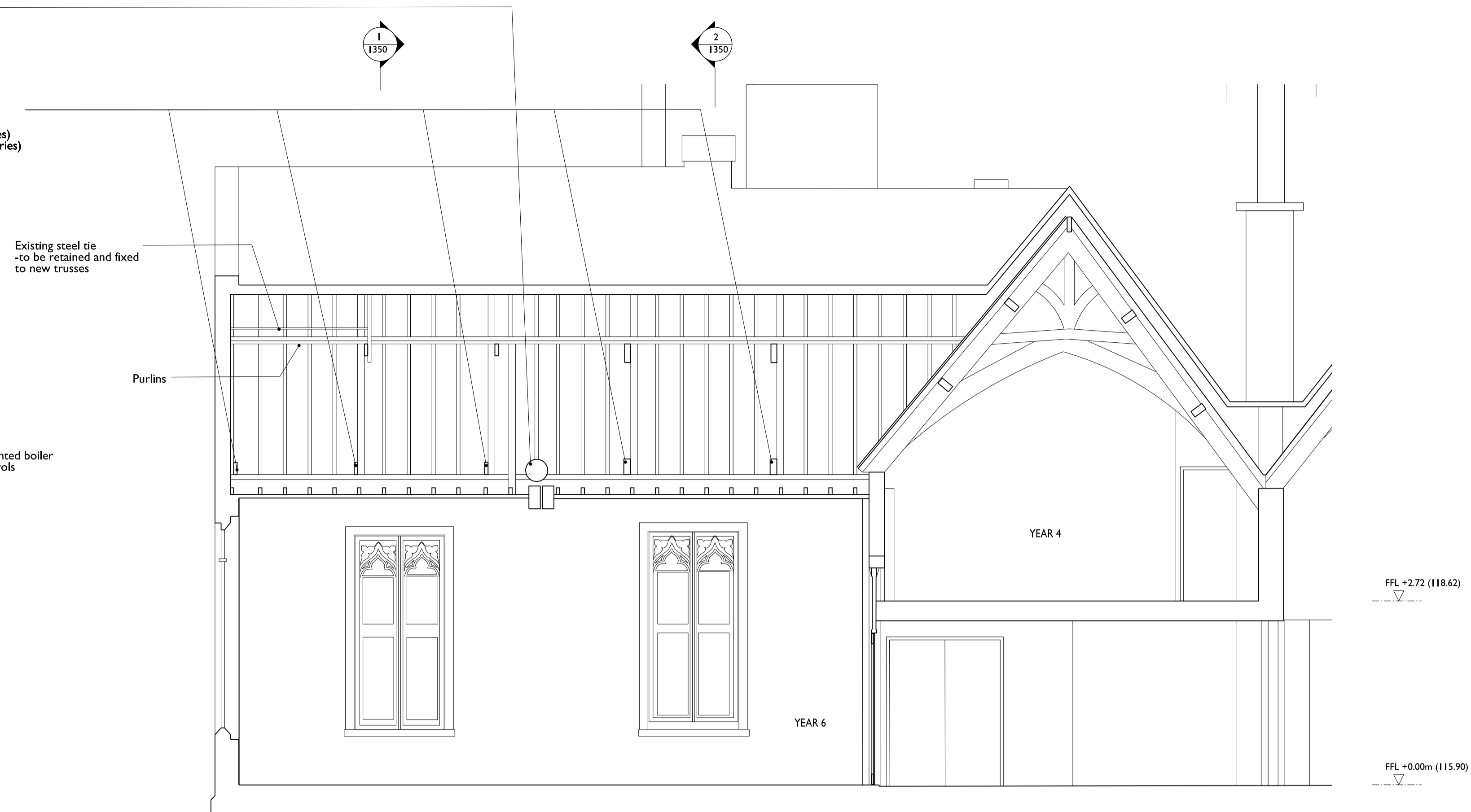
3 Section 2-2 1350 Scale 1:50/100