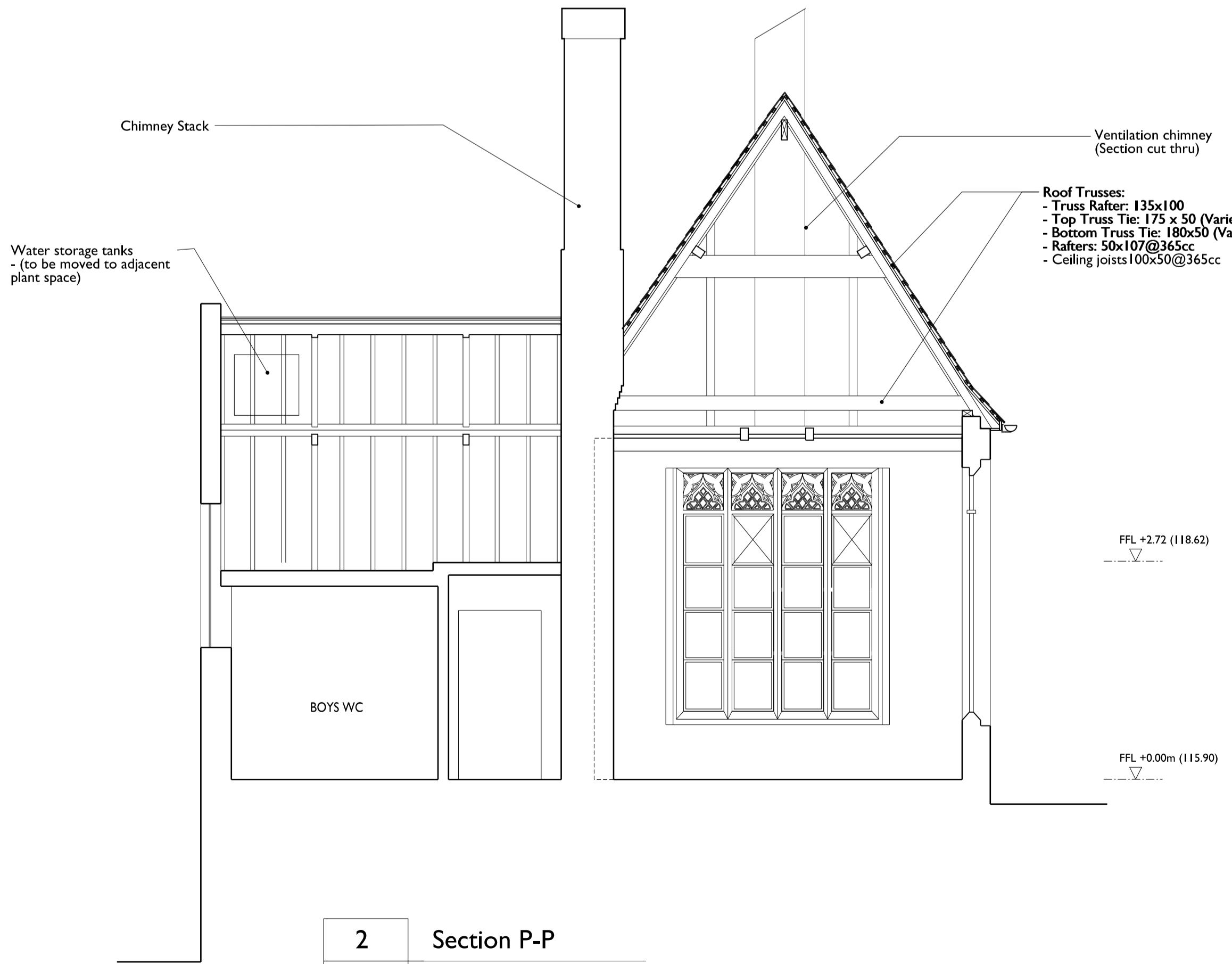
2 Section P-P 1350 Scale 1:50/100