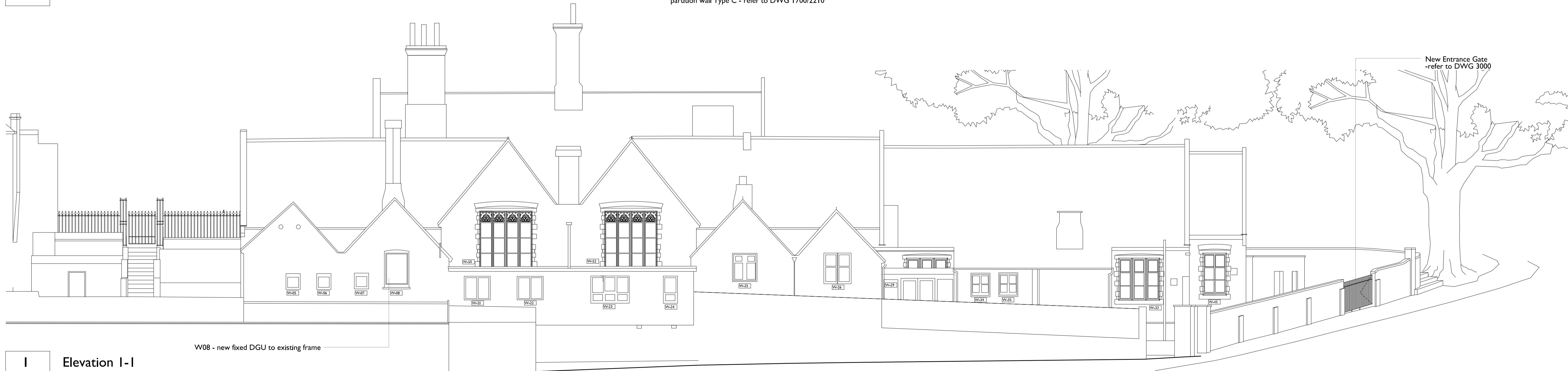
1 Elevation 1-1 1200 Scale 1:100

SCABAL ARCHITECTS LTD. 25 Hatton Garden London EC1N 8BQ UK t: +44 (0) 20 7033 8788 e: team@scabal.net