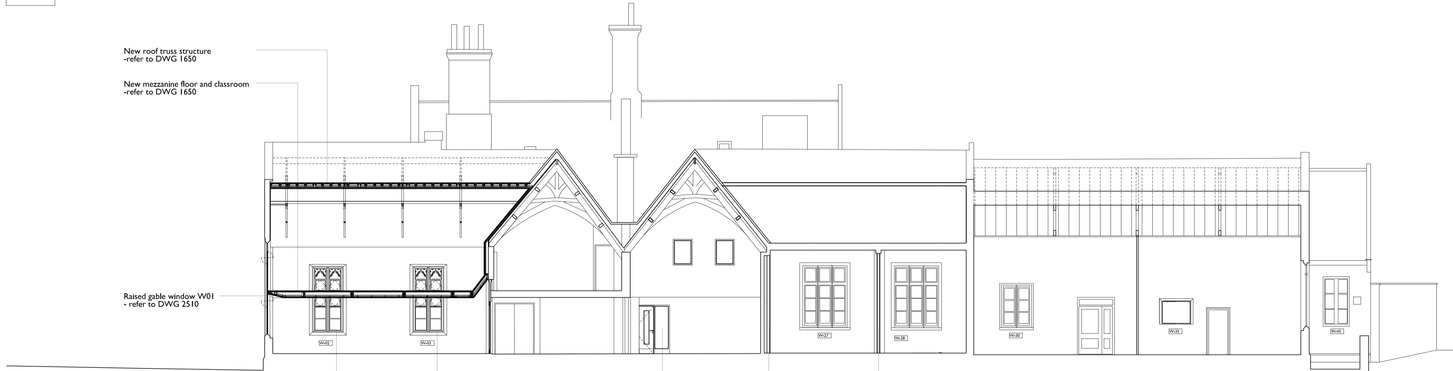
2 Section 2-2 1200 Scale 1:100