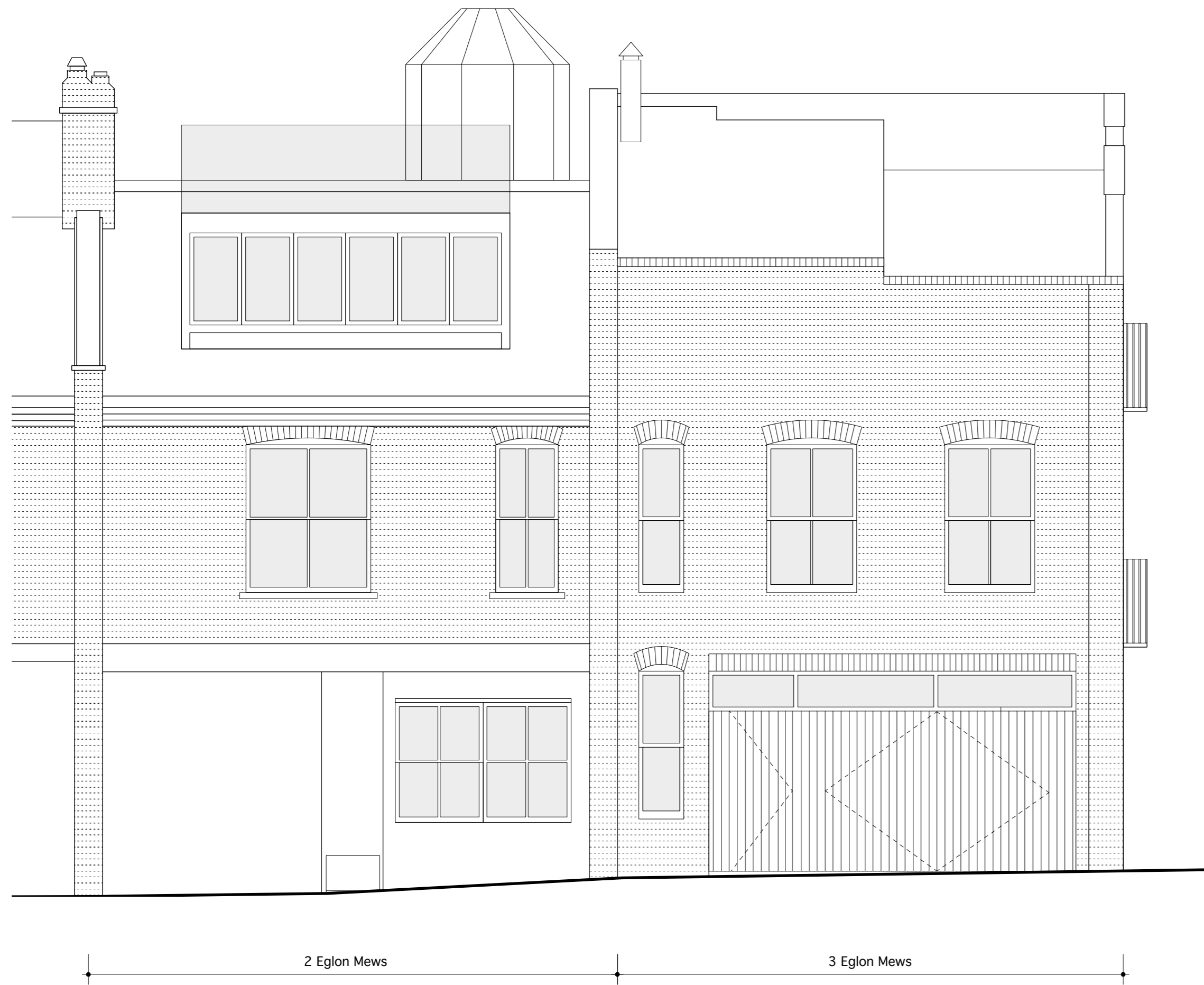
1 Proposed North Elevation 1:50 @ A1