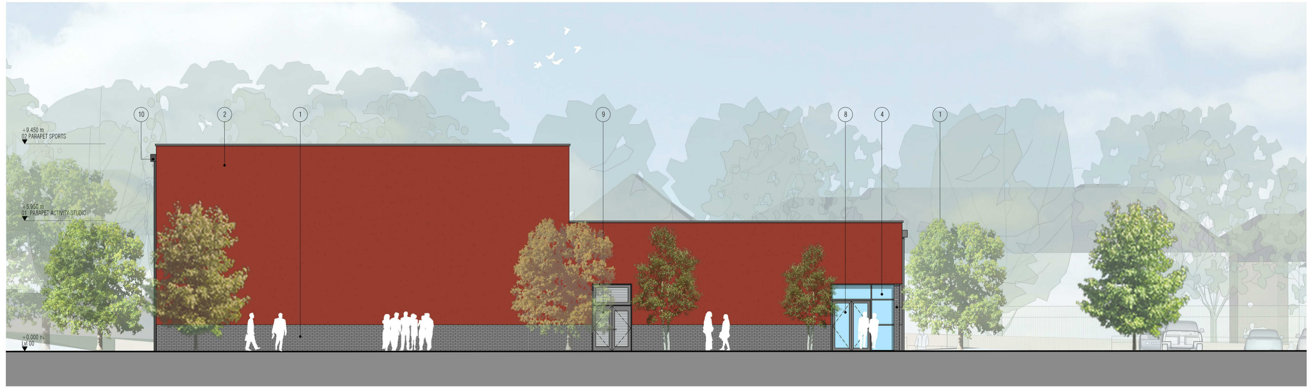
1 NORTH ELEVATION EL-102 1:100