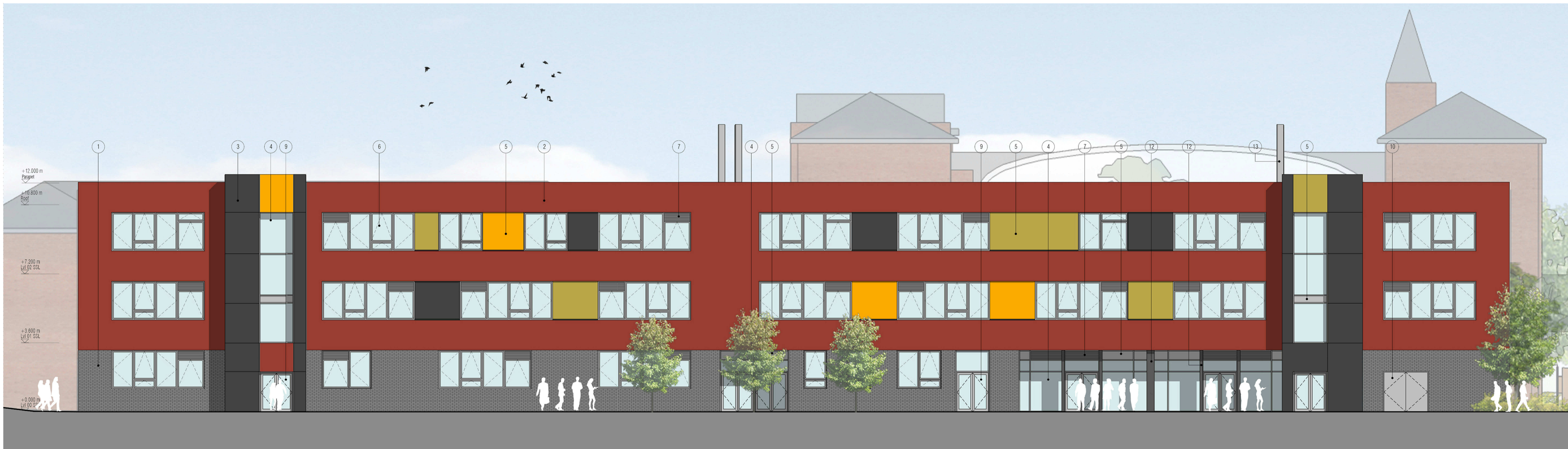
1 EAST ELEVATION JW-202 1:200