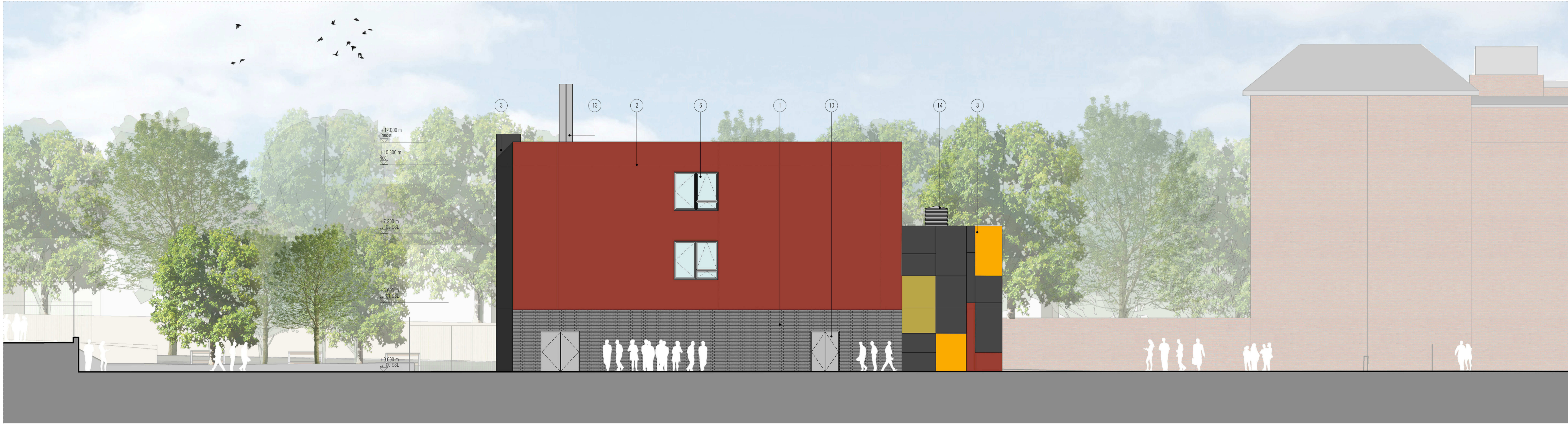
2 NORTH ELEVATION JW-202 1:200