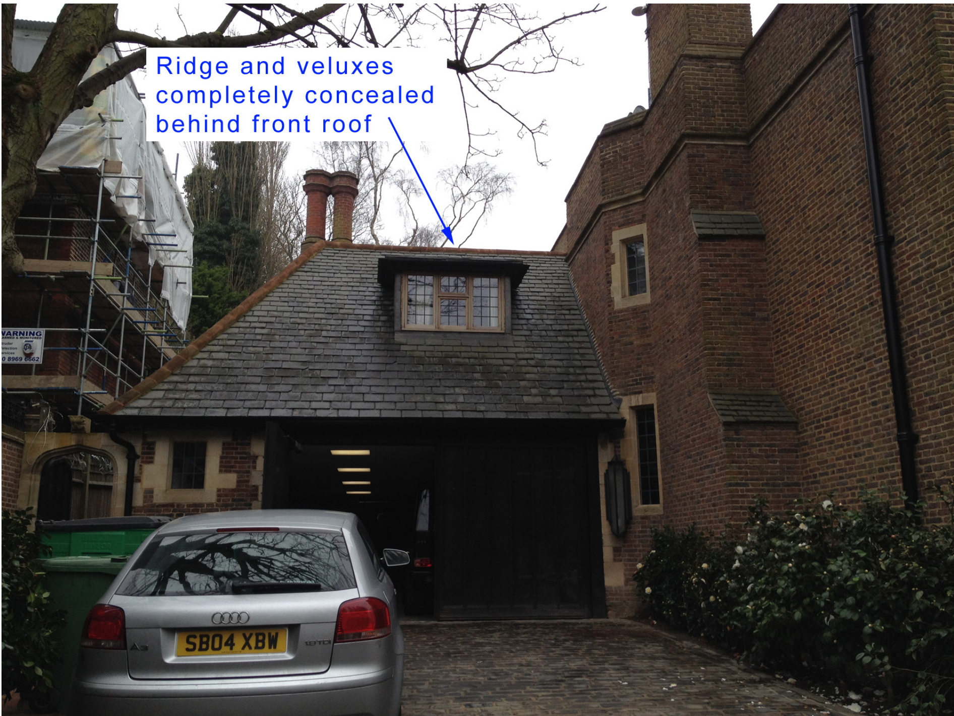
2 VIEW 2: FROM DRIVEWAY AT FRONT OF HOUSE