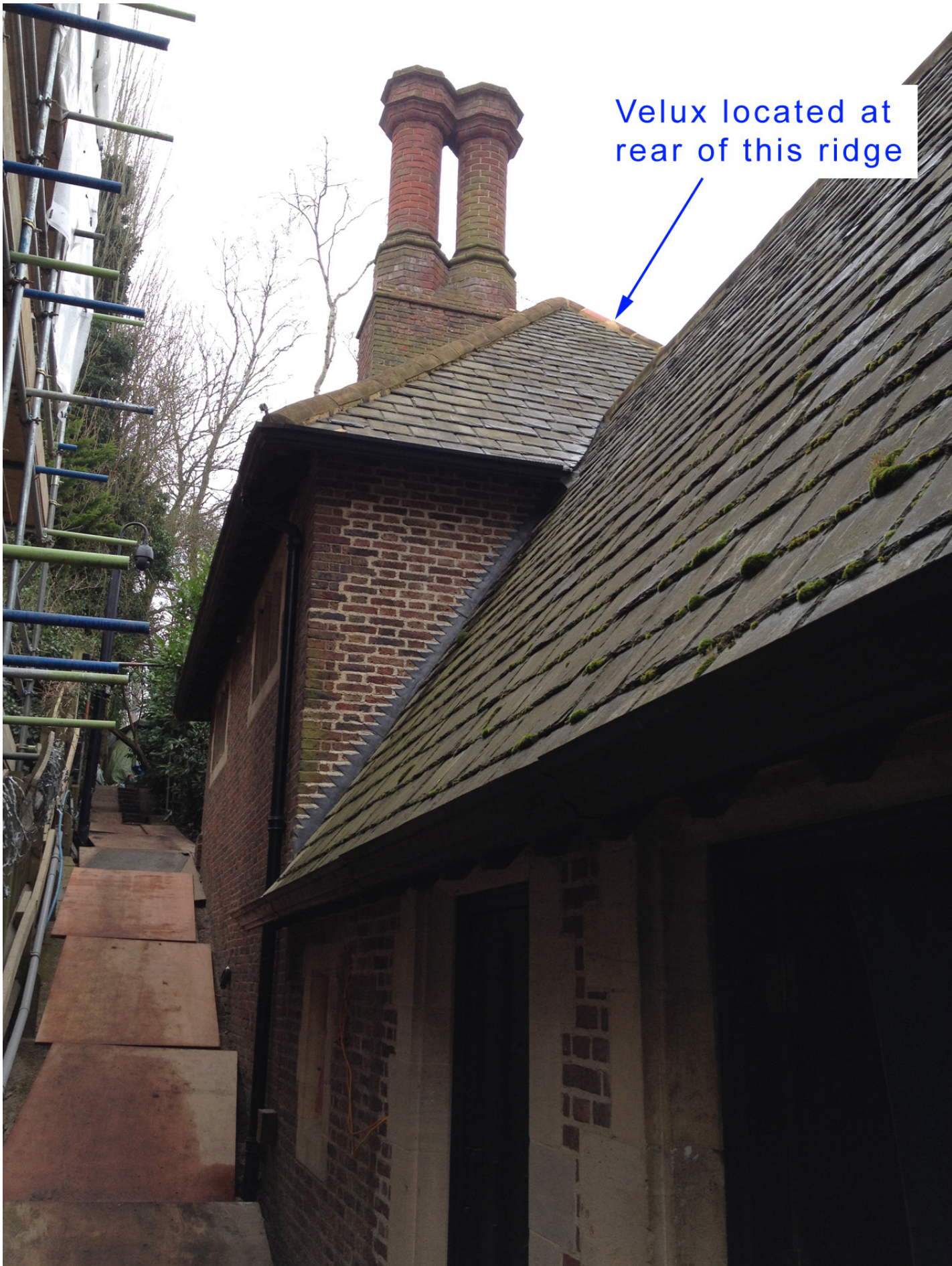
4 VIEW 4: FROM EAST BOUNDARY LINE