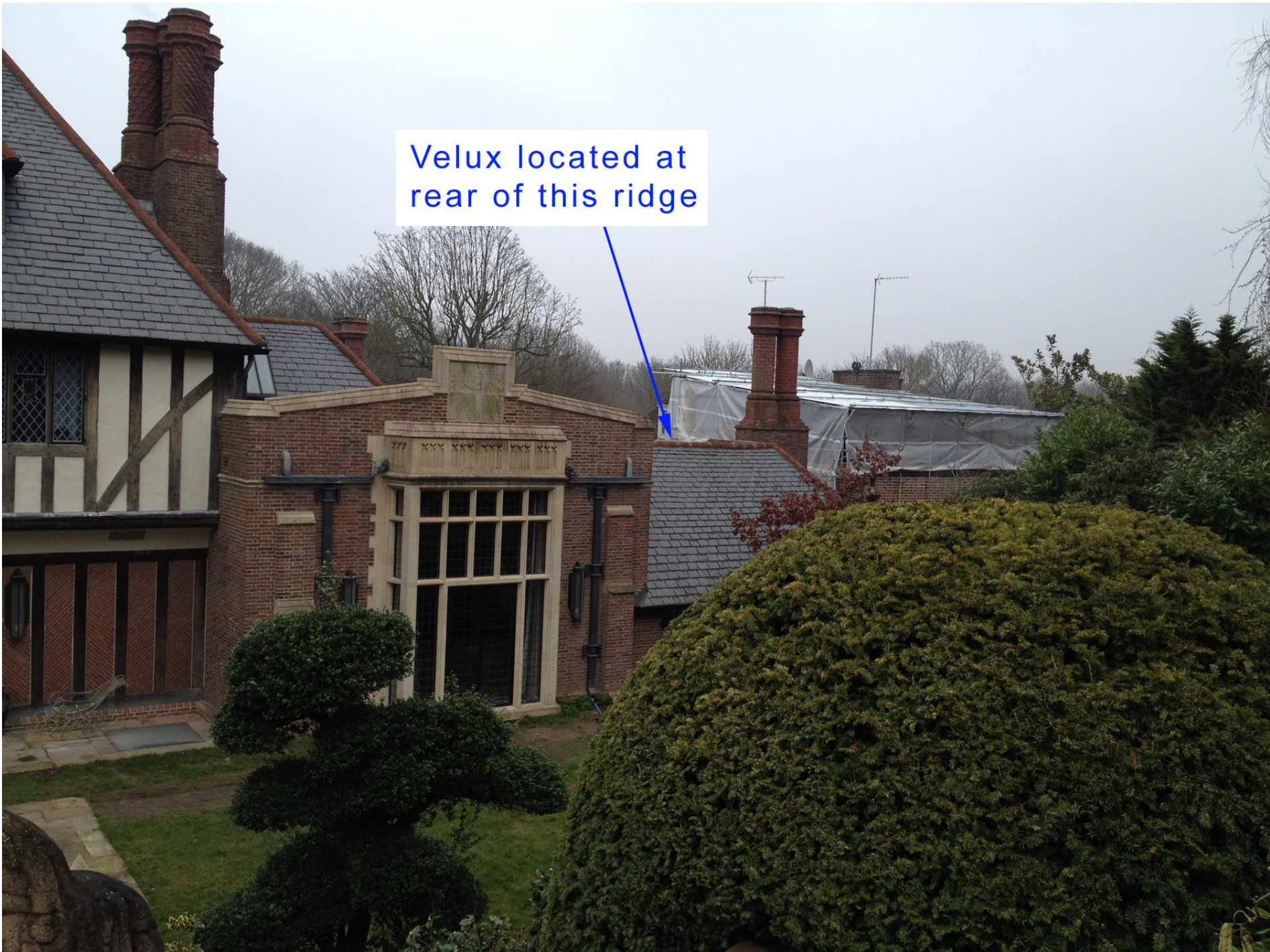
1 VIEW 1: FROM GARDEN AT REAR OF HOUSE