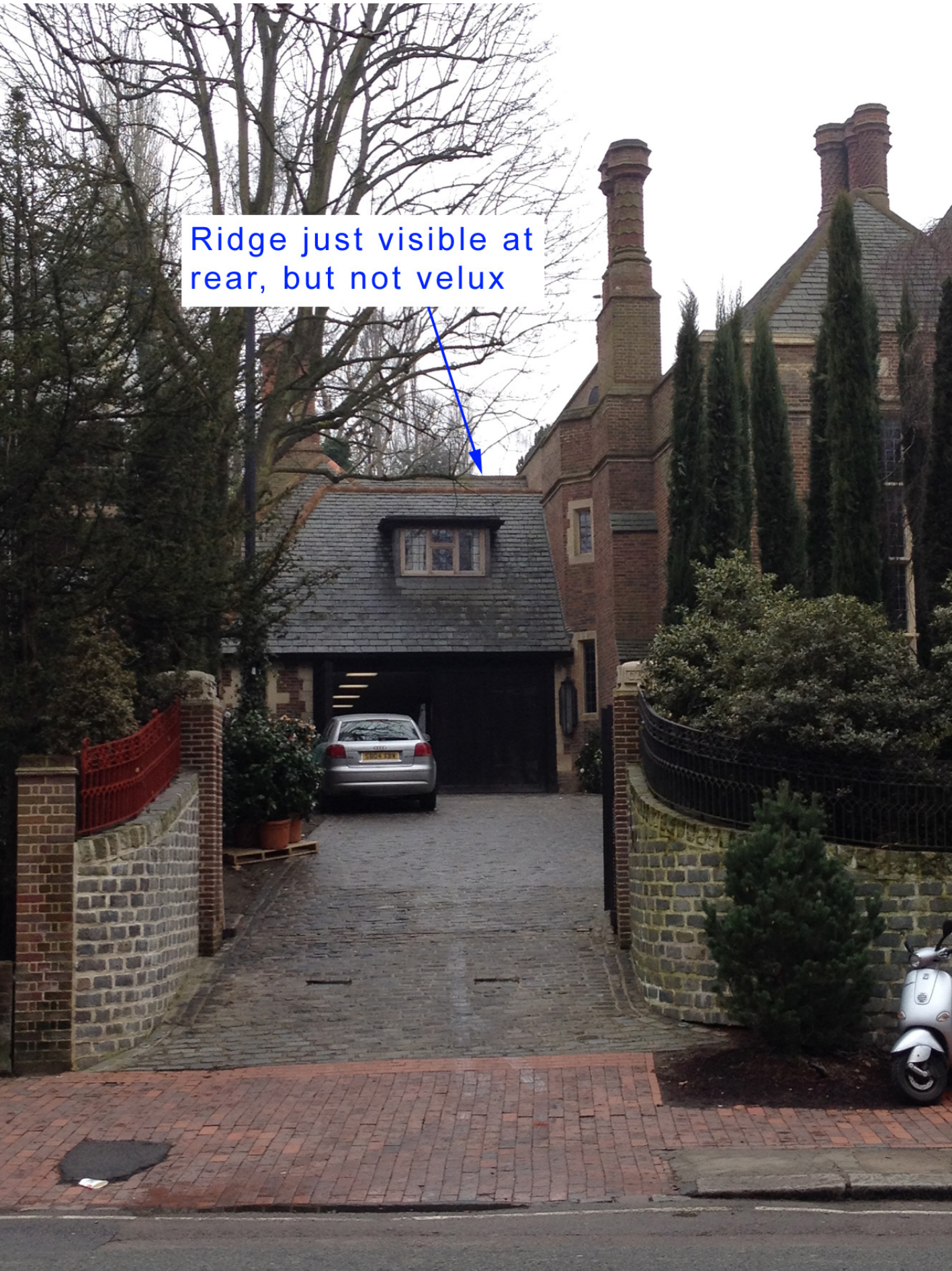
3 VIEW 3: FROM PAVEMENT OPPOSITE THE HOUSE