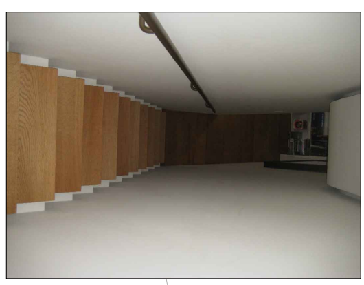
New stairs to attic Solid oak on timber/Plasterboard construction

All measurements in millimetres unless otherwise stated / Do not scale from drawing / Verify all dimensions on site / This drawing is to be read in conjunction with all other relevant drawings and specifications / Refer to Architect in case of any ambiguity or discrepancy / This drawing and its design are copyright / All rights remain the property of STUDIOaida