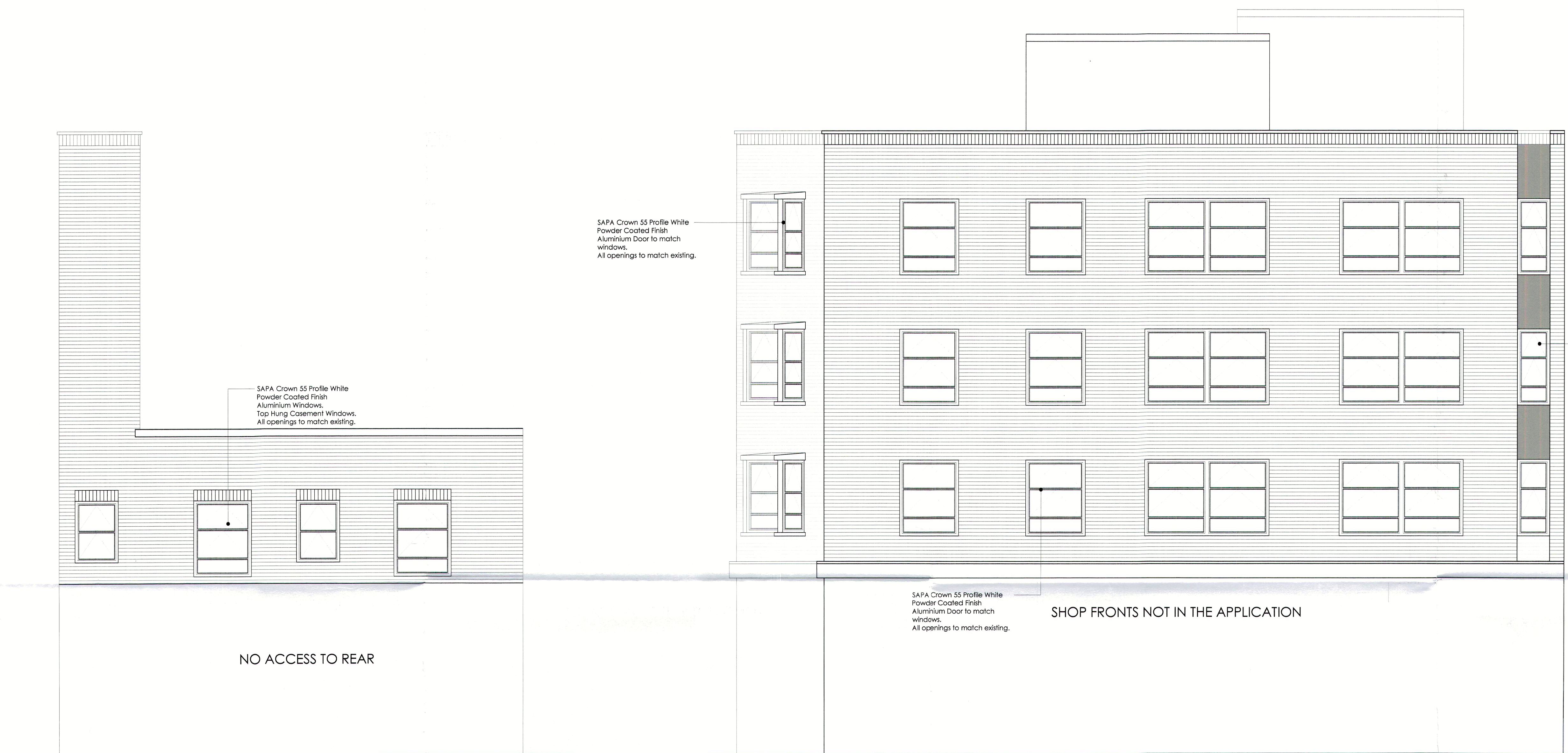
ELEVATION-D Scale 1:50