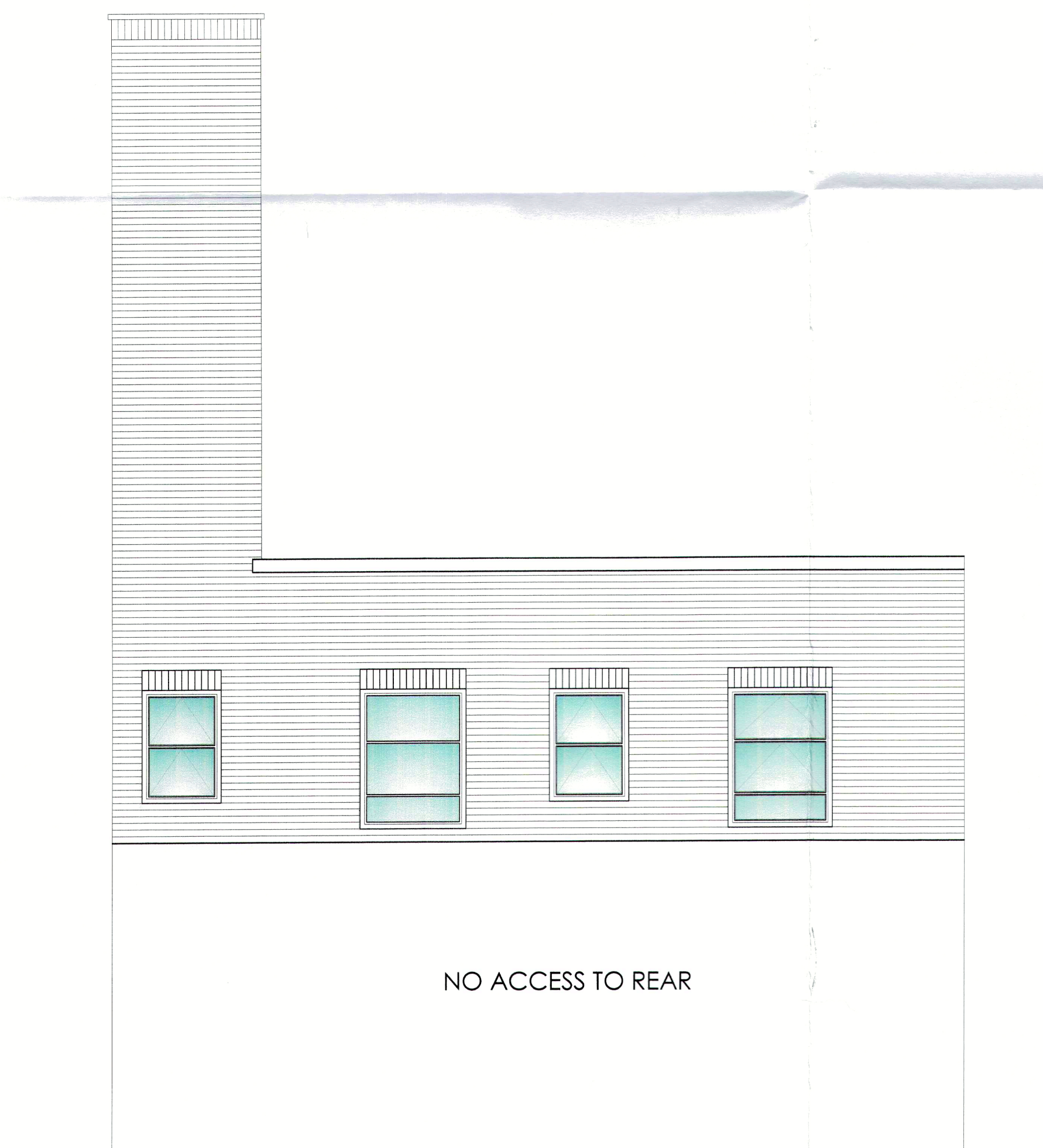
ELEVATION-D Scale 1:50