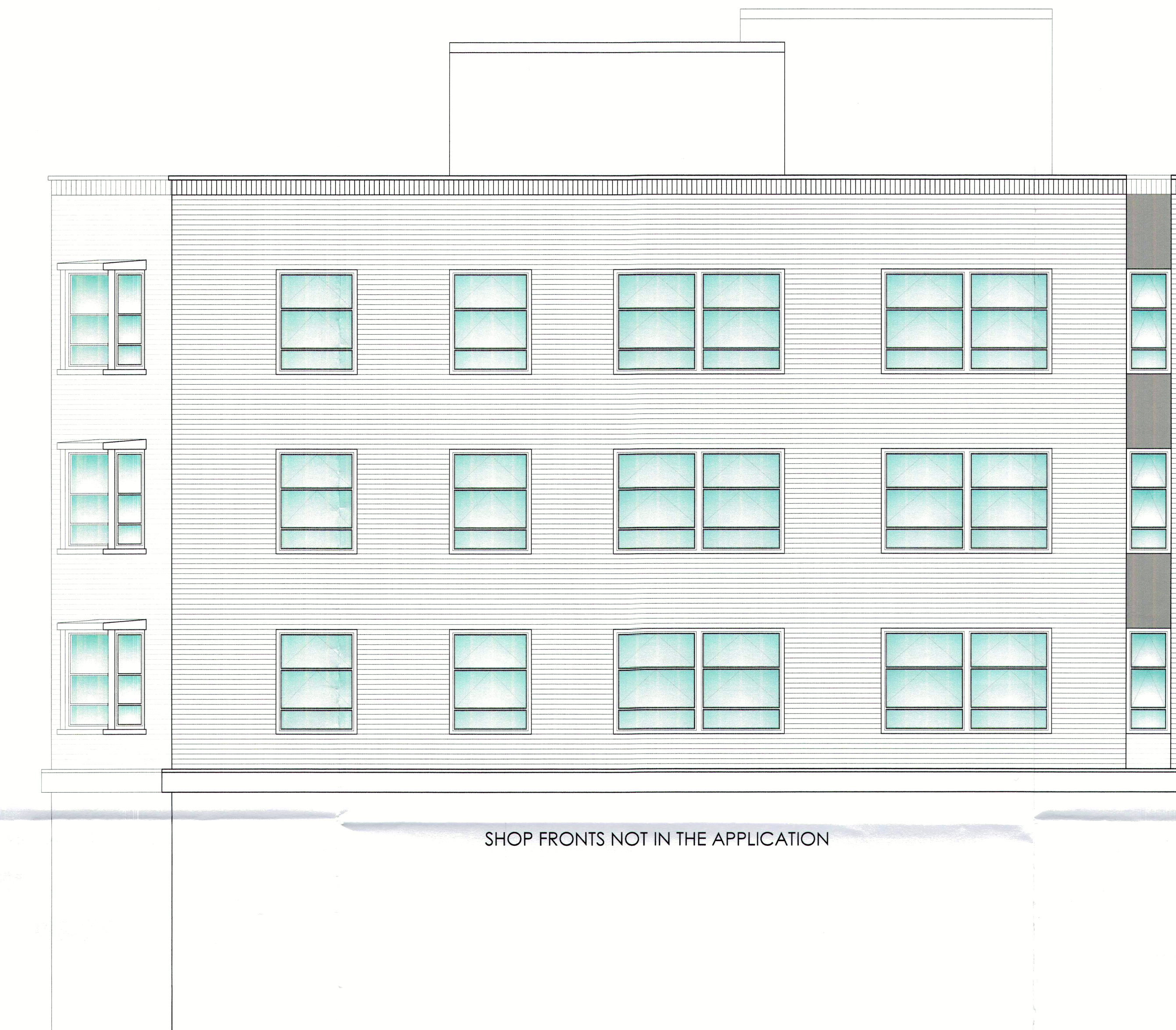
ELEVATION-B Scale 1:50