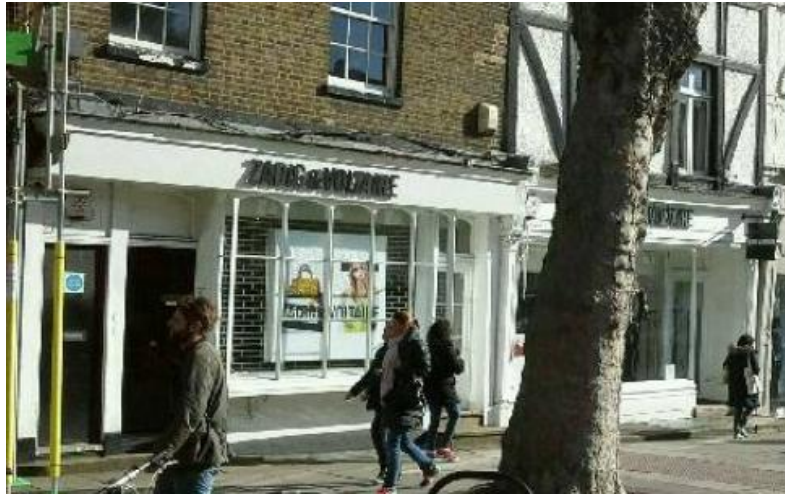
Shops nearby have traditional wooden shop fronts with non-illuminated individual letter fascias and heritage style projecting signs.