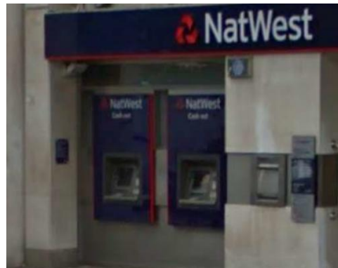
EXISTING ATM WALL