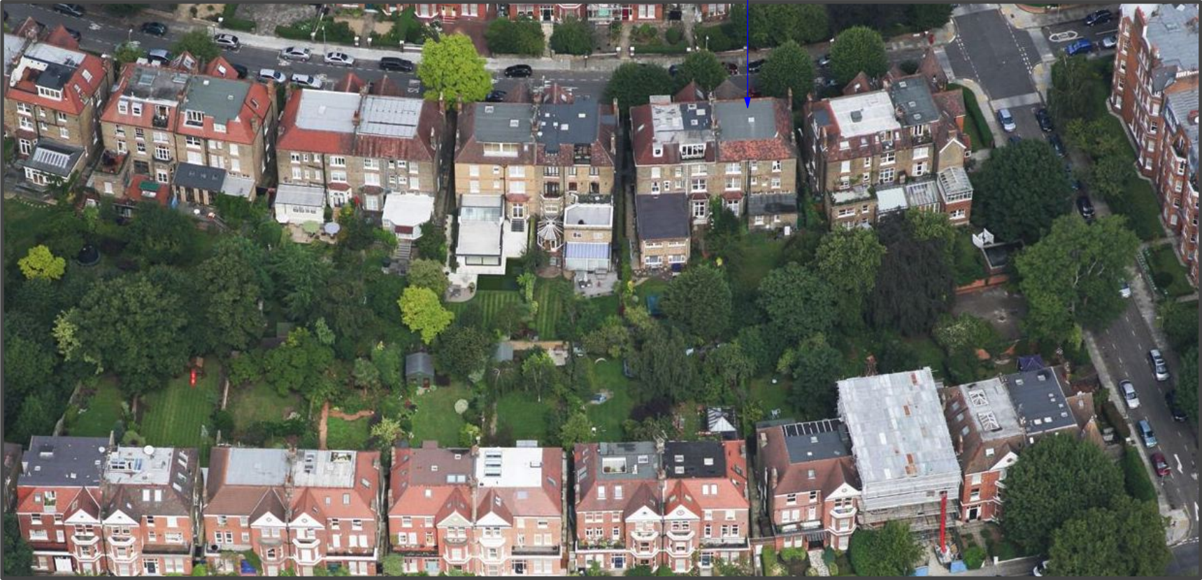
REAR AERIAL VIEW