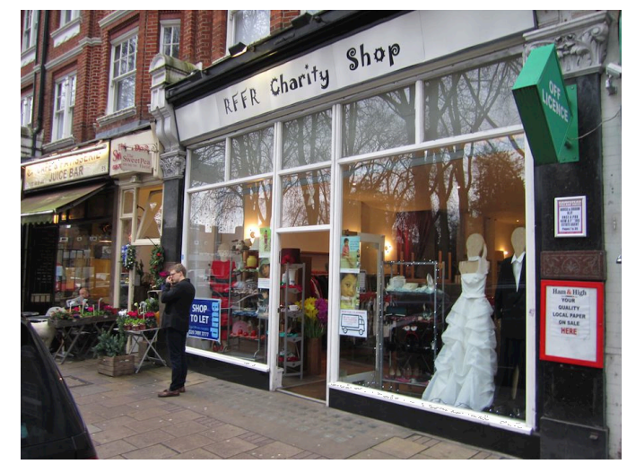
04 Photo of Existing Shopfront N.T.S