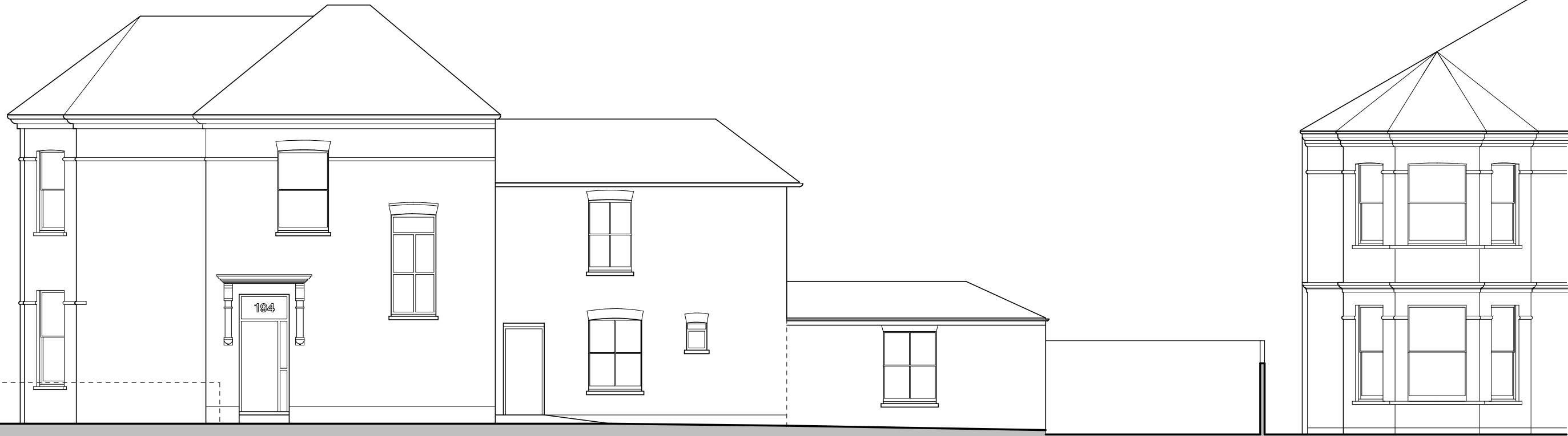
NORTH ELEVATION, facing Ebbsfleet Road

6000 bedroom extension, slate pitched roof, painted brickwork and timber sash window to match existing house