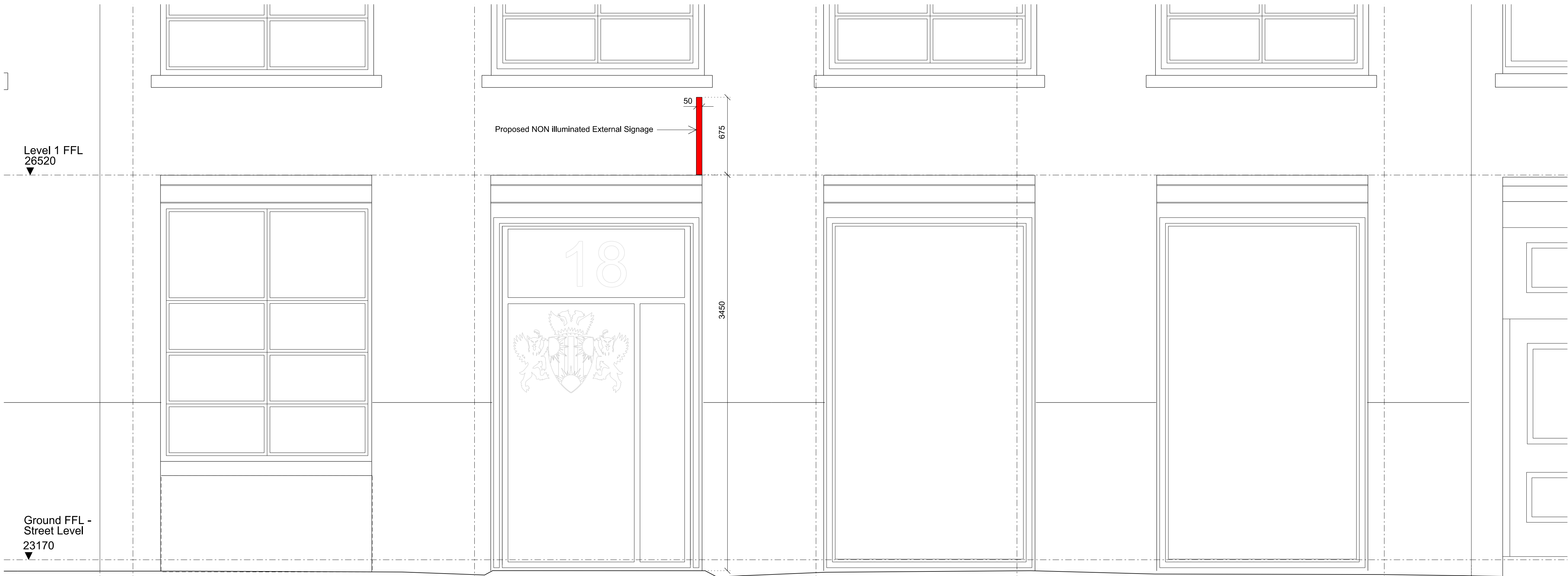
18 Stephenson Way - Proposed Elevation

Notes Projecting NON illuminated sign comprising aluminium inner framework with re-inforced welded corners clad with SignEdge 50mm frame with aluminium face panels stove enameled Eggshell RAL7024 Grey and silk screen printed on both sides Opaque White logo and logo style lettering. Inner framework machined down one edge and fitted with support bars for fixing to wall (support/fixing bars will be hidden within the sign)