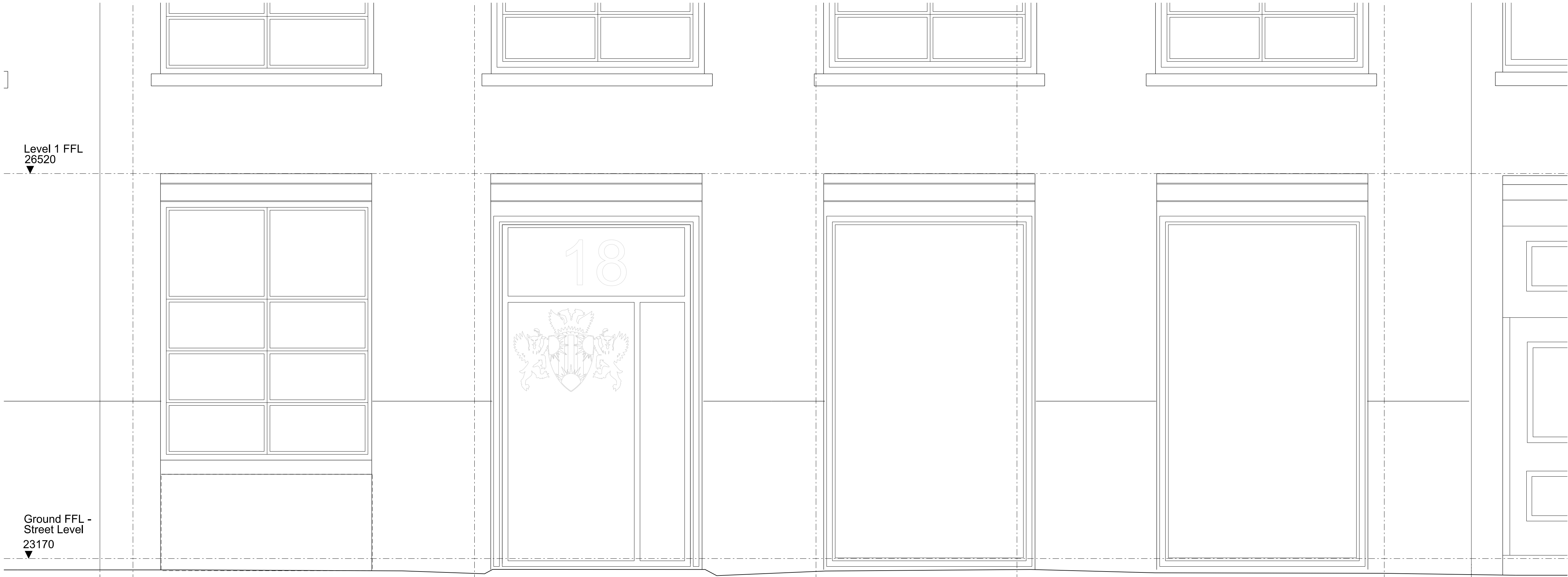
18 Stephenson Way - Existing Elevation