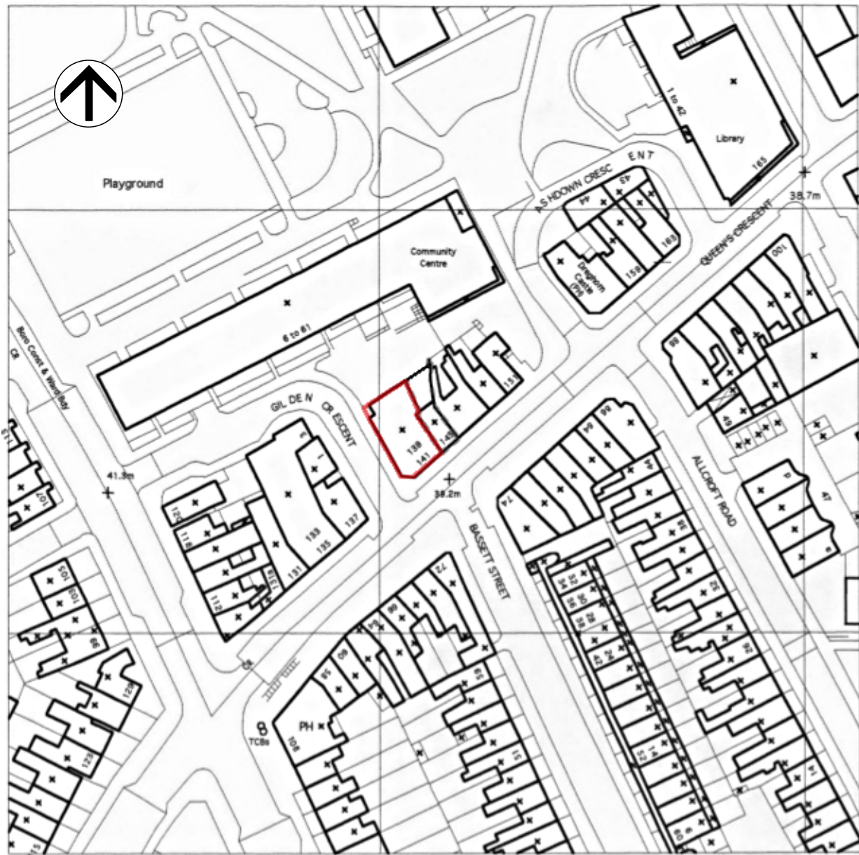
1 LOCATION PLAN Scale: 1:1250