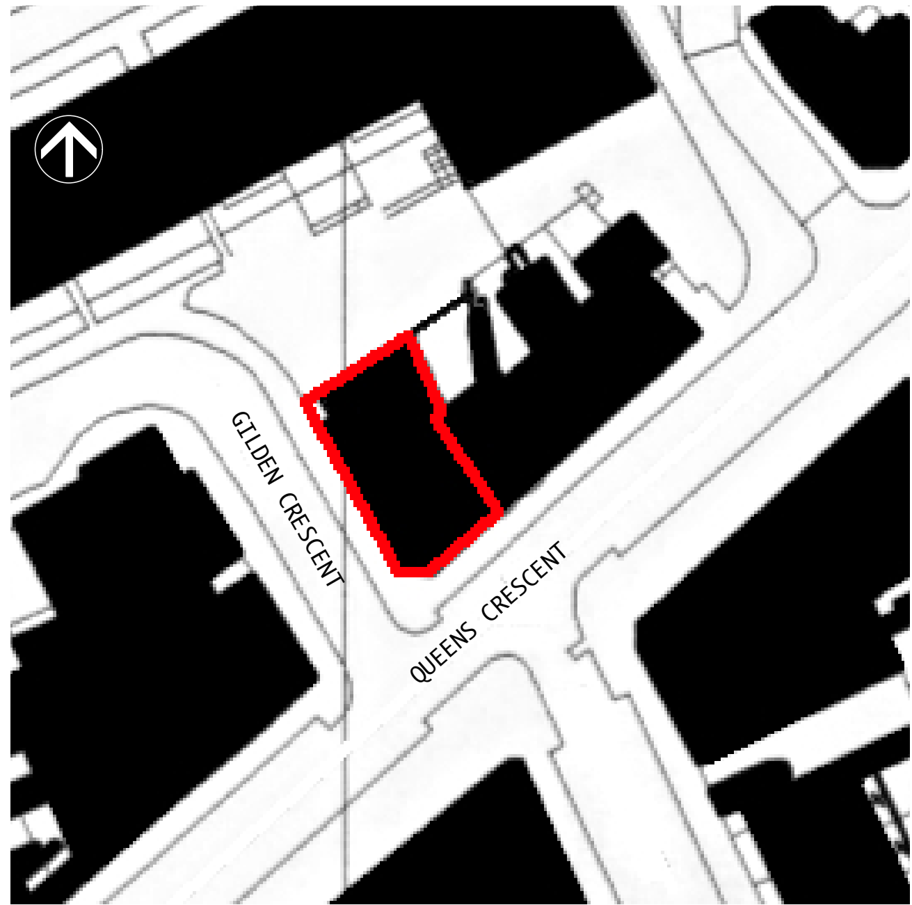
2 BLOCK PLAN Scale: 1:500