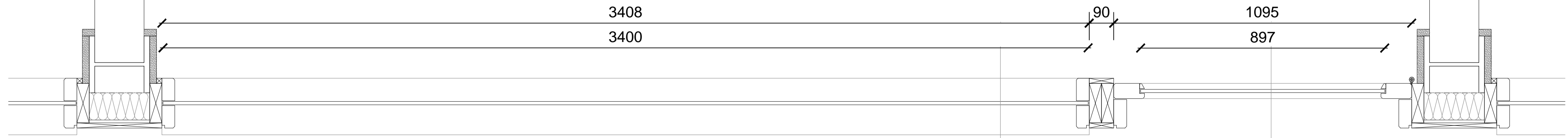
GROUND FLOOR PLAN / / Detail A scale 1:10