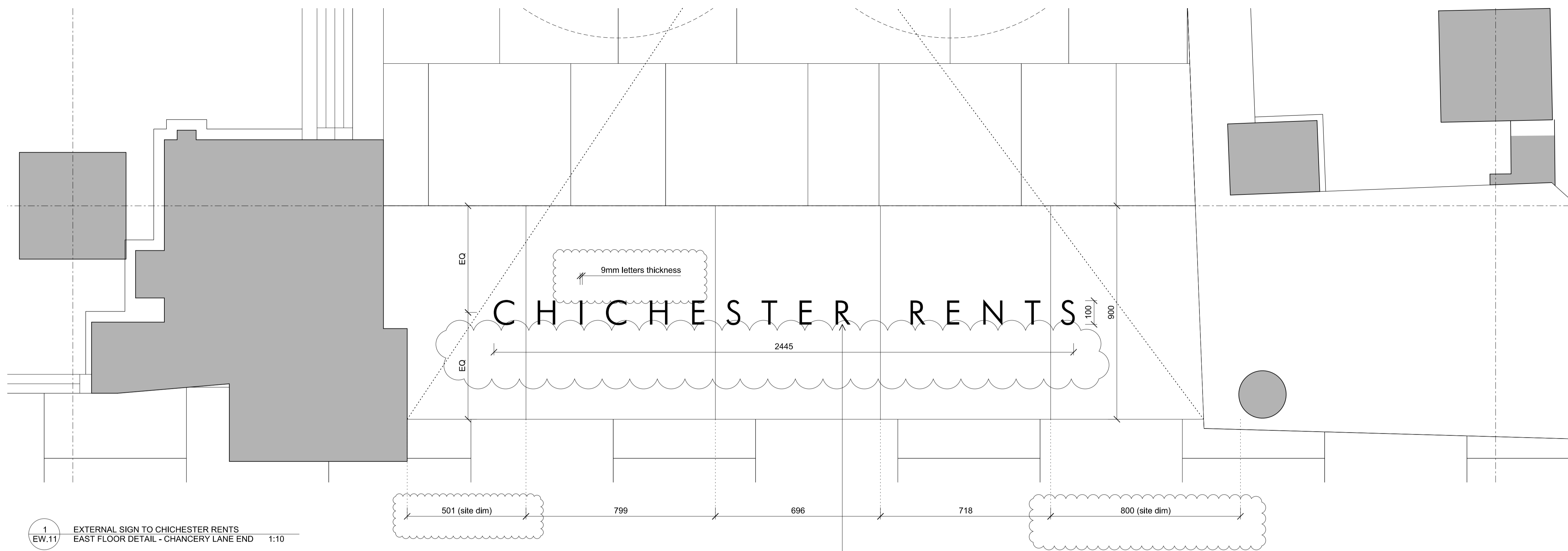
1 EXTERNAL SIGN TO CHICHESTER RENTS EAST FLOOR DETAIL - CHANCERY LANE END 1:10

3mm thick x 100mm tall double spaced Futura Light font brushed stainless steel letters recessed into 50mm Yorkstone paving (flush). Text centred between gate posts. Letters to have studs on reverse recessed into pockets in stone. Letters sealed with clear resin.