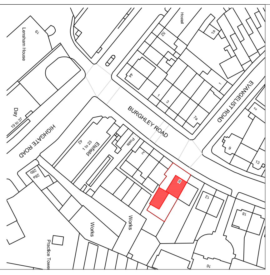
Location Plan (1:1250)