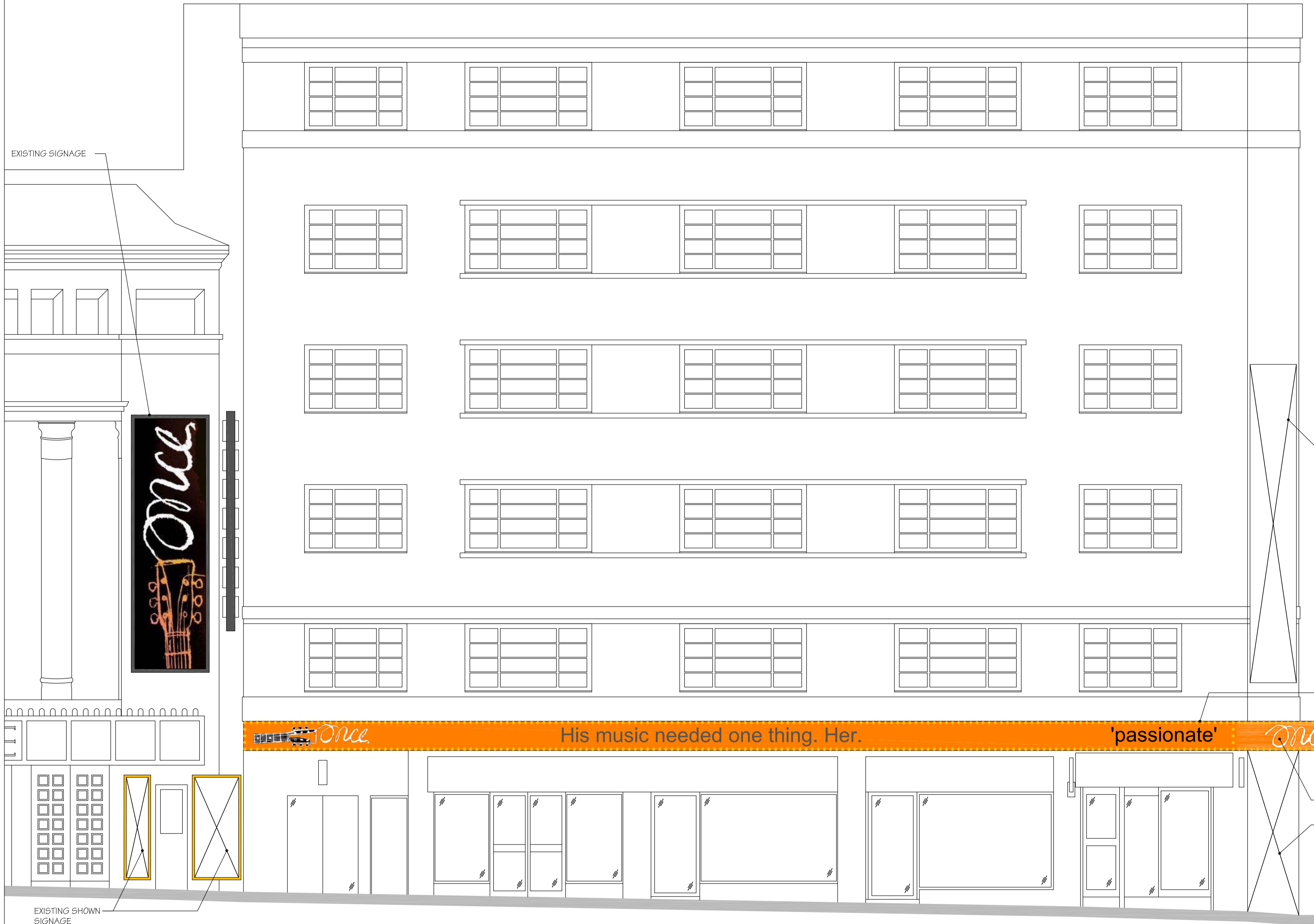
EXISTING CHARING CROSS ROAD ELEVATION (SCALE 1:50 AT A1)