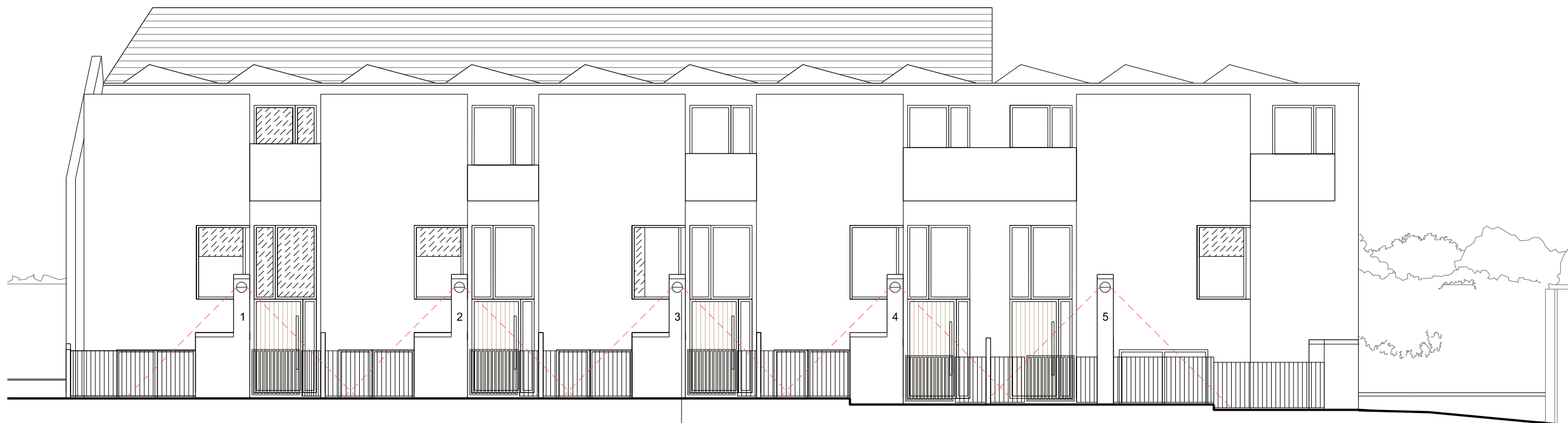
PROPOSED FRONT ELEVATION ALONG COLLEGE LANE