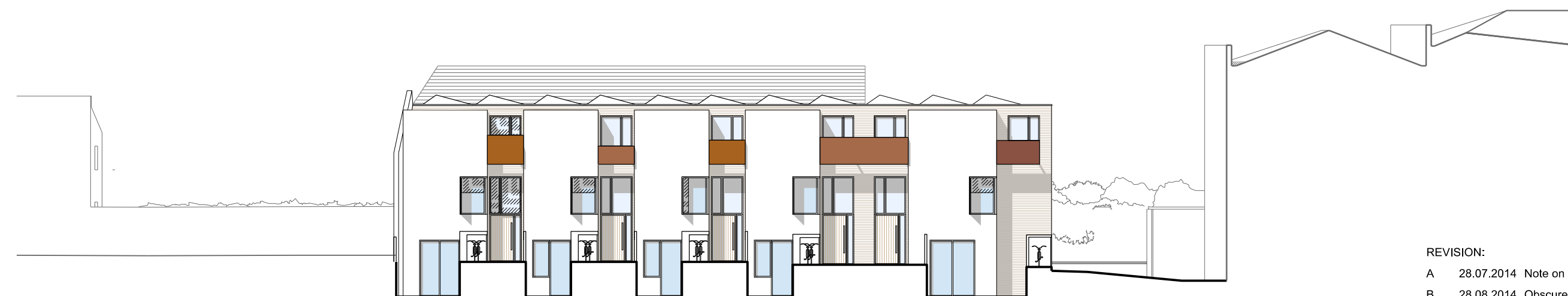
PROPOSED FRONT ELEVATION THROUGH ENTRANCE AREAS - AND ELEVATION OPPOSITE - 1:200 @ A3