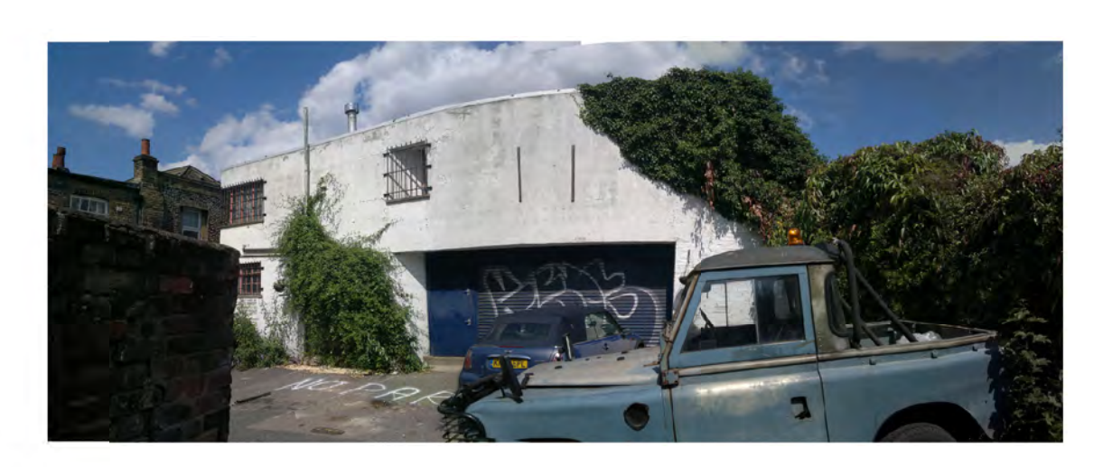
1b.Existing photo of College Yard from boundary with 1A College Yard