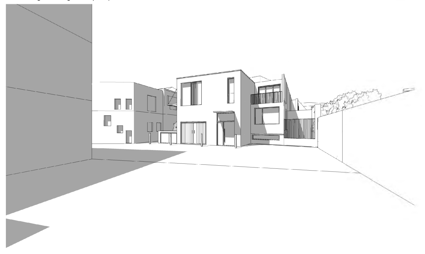
1a.Proposed building side perpsective view