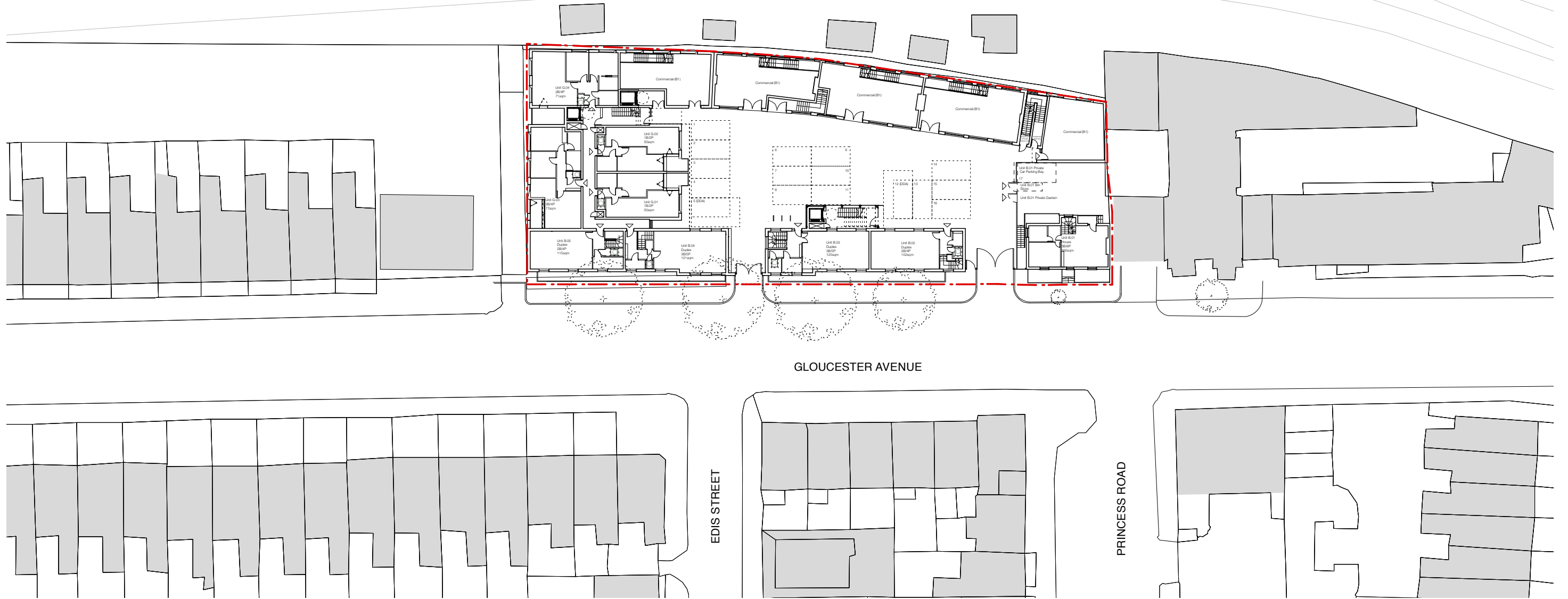
A GA.10 Location Plan 1:250 @A1 1:500 @A3