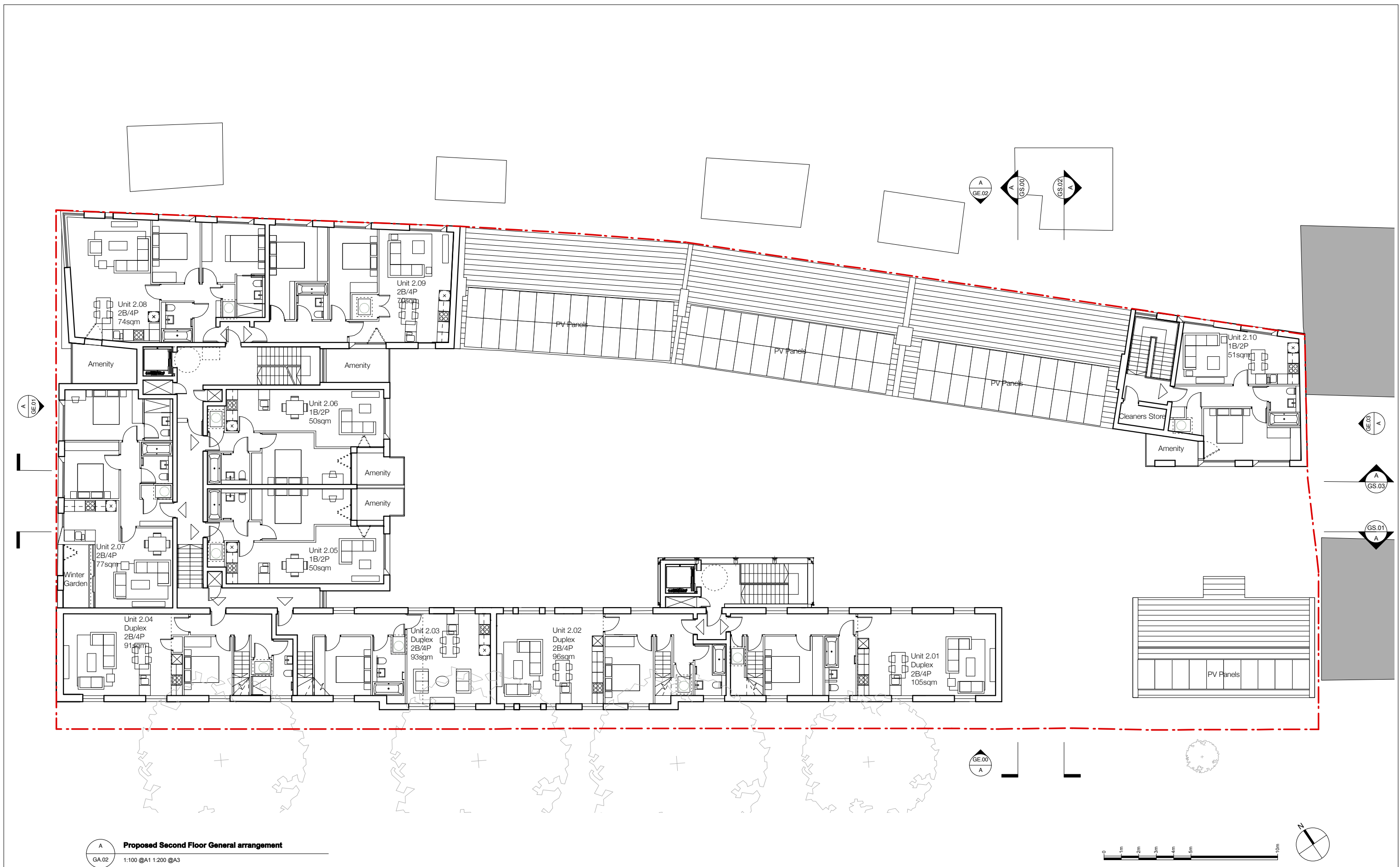
Proposed Second Floor General arrangement GA.02 1:100 @A1 1:200 @A3

Information contained within this drawing is the sole copyright of 21st Architecture Ltd. and is not to be reproduced without express permission. No implied licence exists. This drawing not to be used for land transfer or valuation purposes. Do not scale from this drawing. All dimensions & levels are to be checked on site by the contractor. Issued for purposes indicated only. Drawing errors and omissions to be reported to the architect.