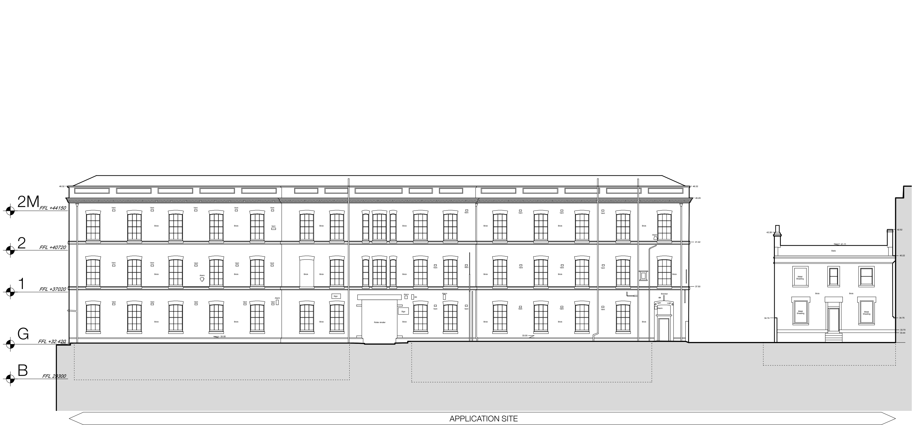
A Existing Gloucester Avenue Elevation EE.00 1:100 @A1 1:200 @A3