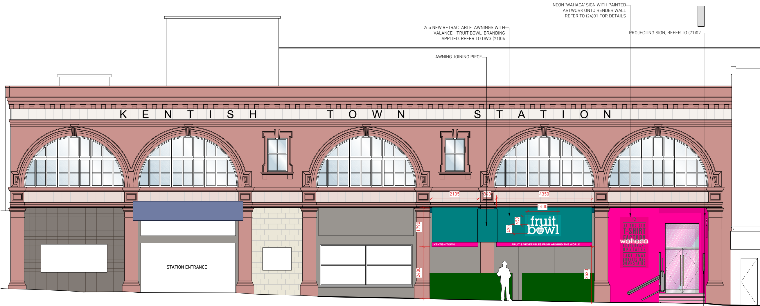
1 PROPOSED SHOPFRONT ELEVATION AWNING EXTENDED Scale: 1:50