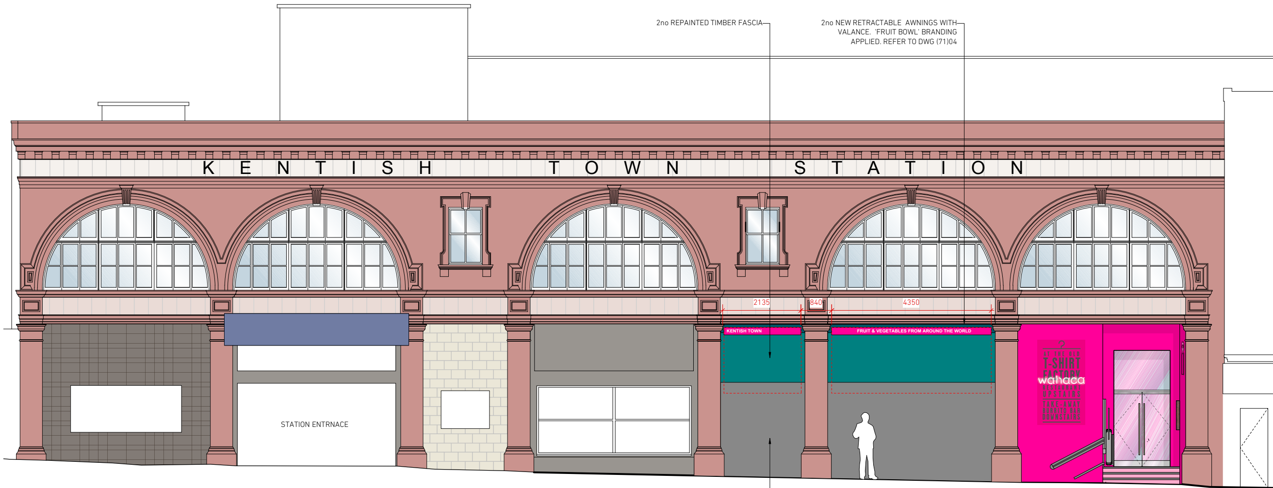
1 PROPOSED SHOPFRONT ELEVATION AWNING RETRACTED Scale: 1:50