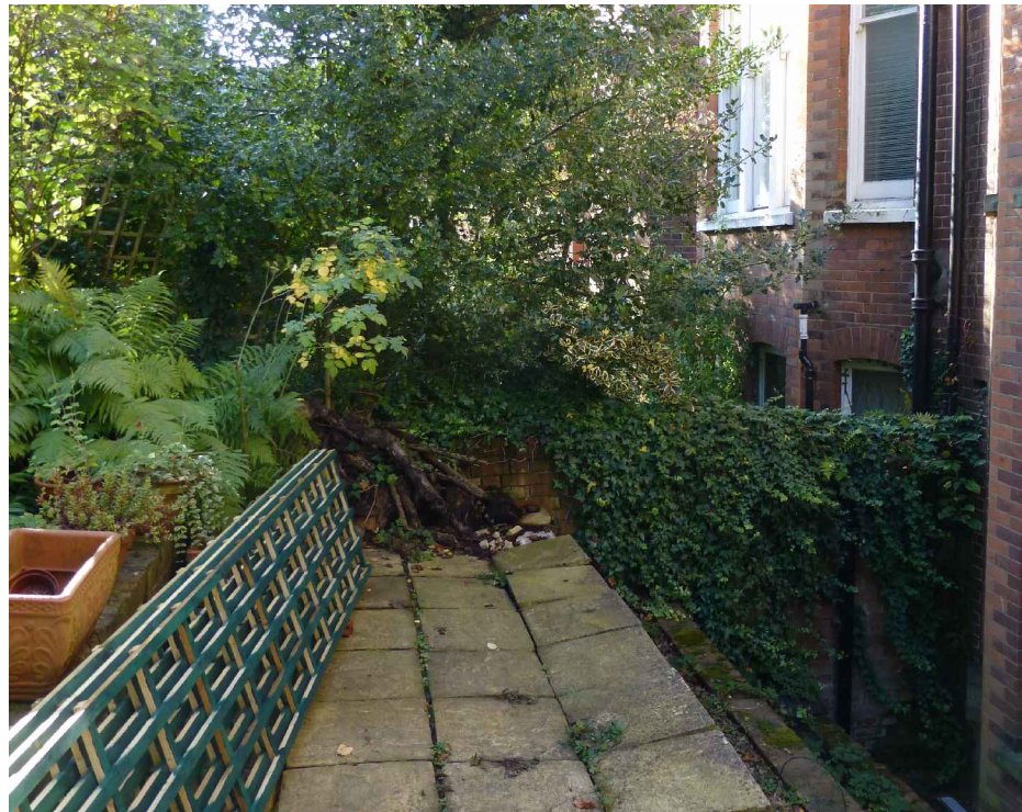
03 PATIO PL208