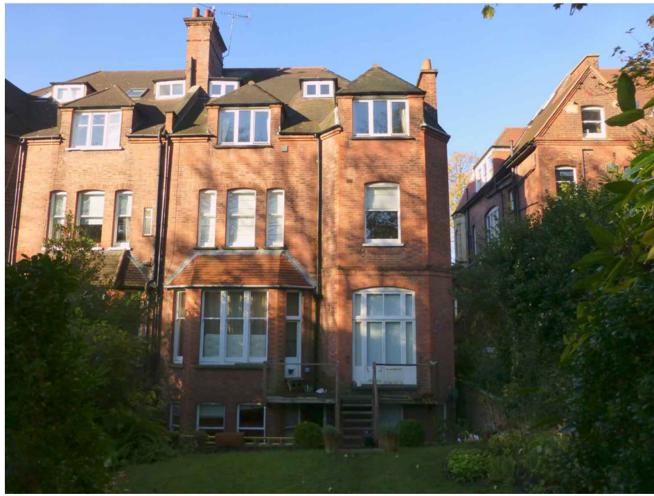
01 REAR OF PROPERTY PL208