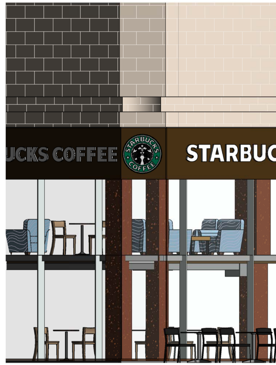
3 EXISTING EXTERIOR ELEVATION 3 Scale: 1 : 50

NOTE: THIS DRAWING IS BASED ON A NON-INTRUSIVE SURVEY CARRIED OUT FOR STARBUCKS. FOR VERIFICATION OF ITEMS BEHIND DRY LININGS ETC A SECOND INTRUSIVE SURVEY WILL BE REQUIRED UNDER INSTRUCTION OF THE STARBUCKS CONSTRUCTION MANAGER.