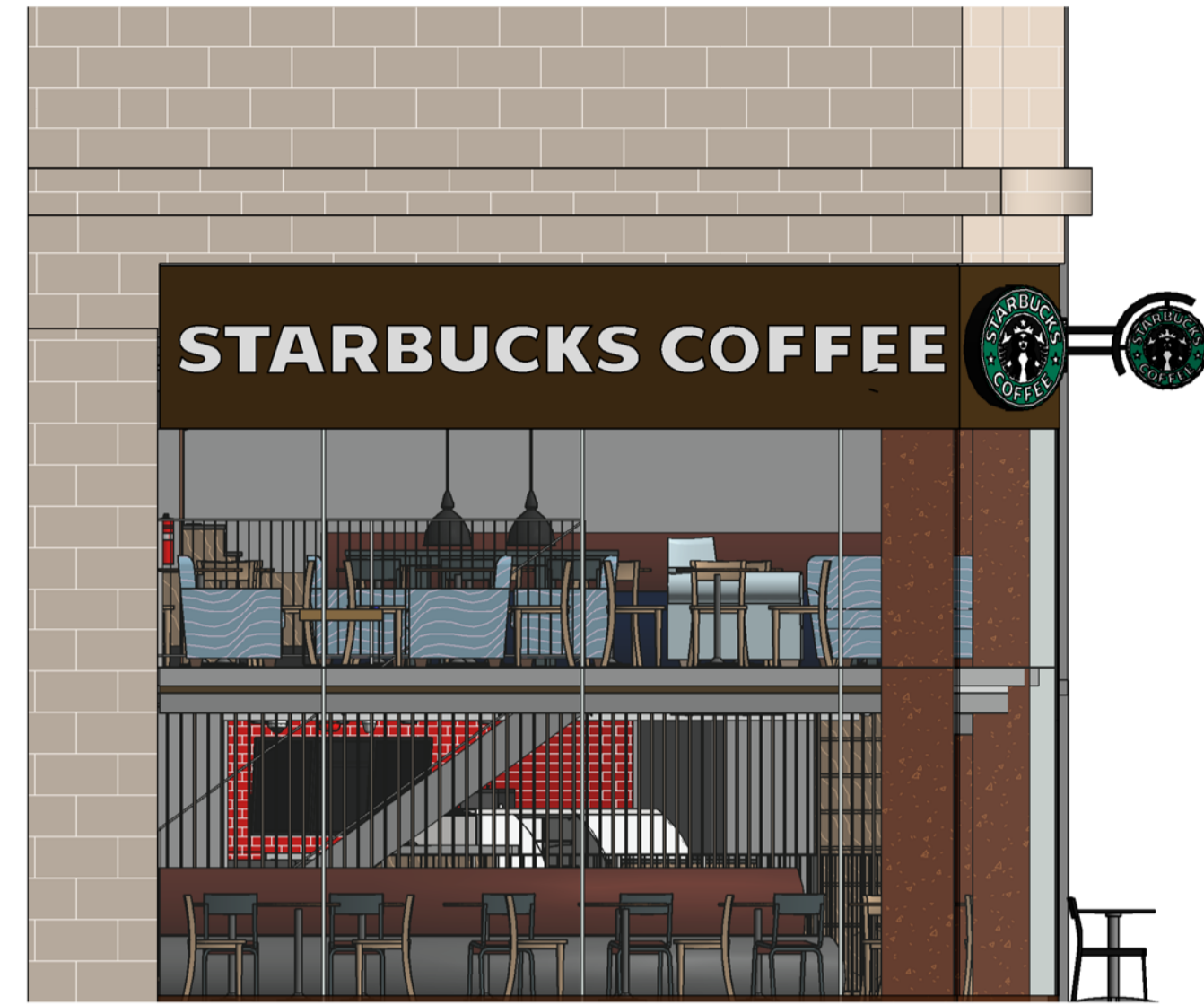
1 EXISTING EXTERIOR ELEVATION 1 Scale: 1 : 50