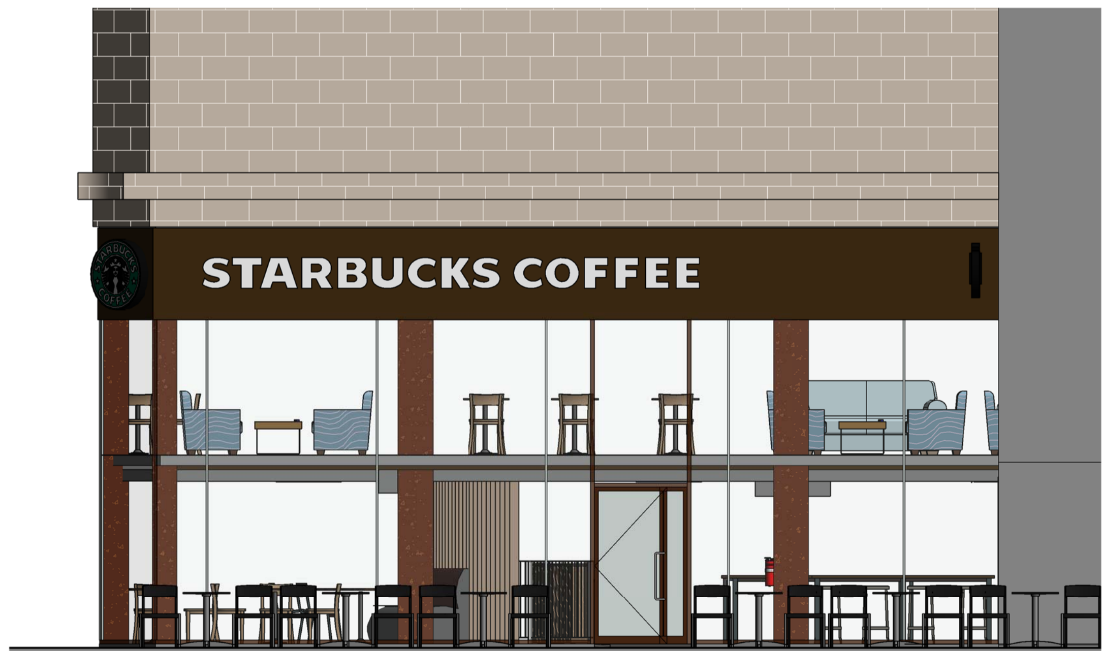
2 EXISTING EXTERIOR ELEVATION 2 Scale: 1 : 50