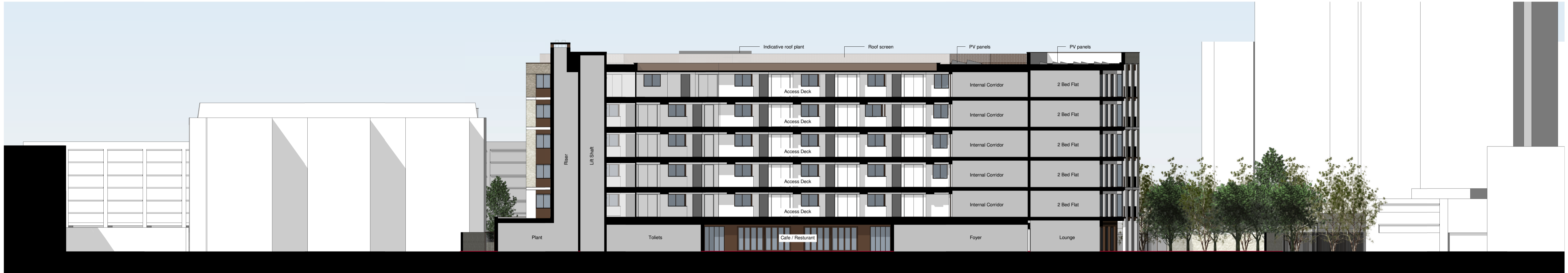
Section AA 1 : 200