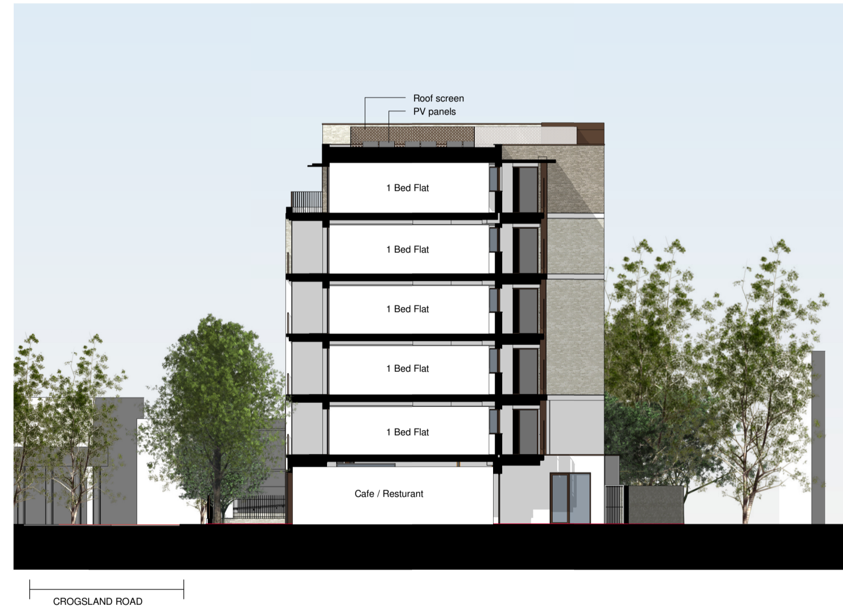
Section - CC 1 : 200