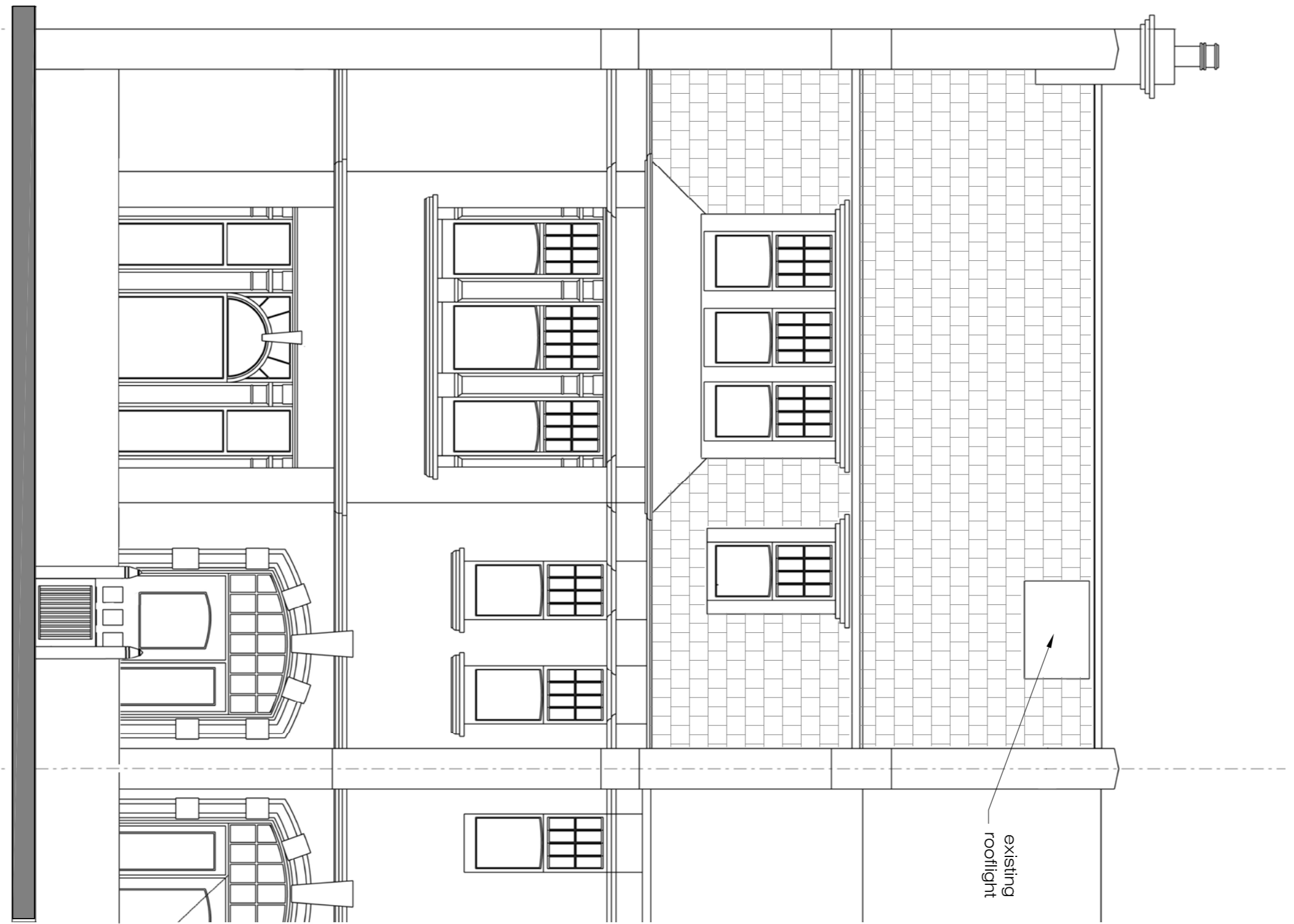
EXISTING Front Elevation SCALE 1/100@A3 EX-02