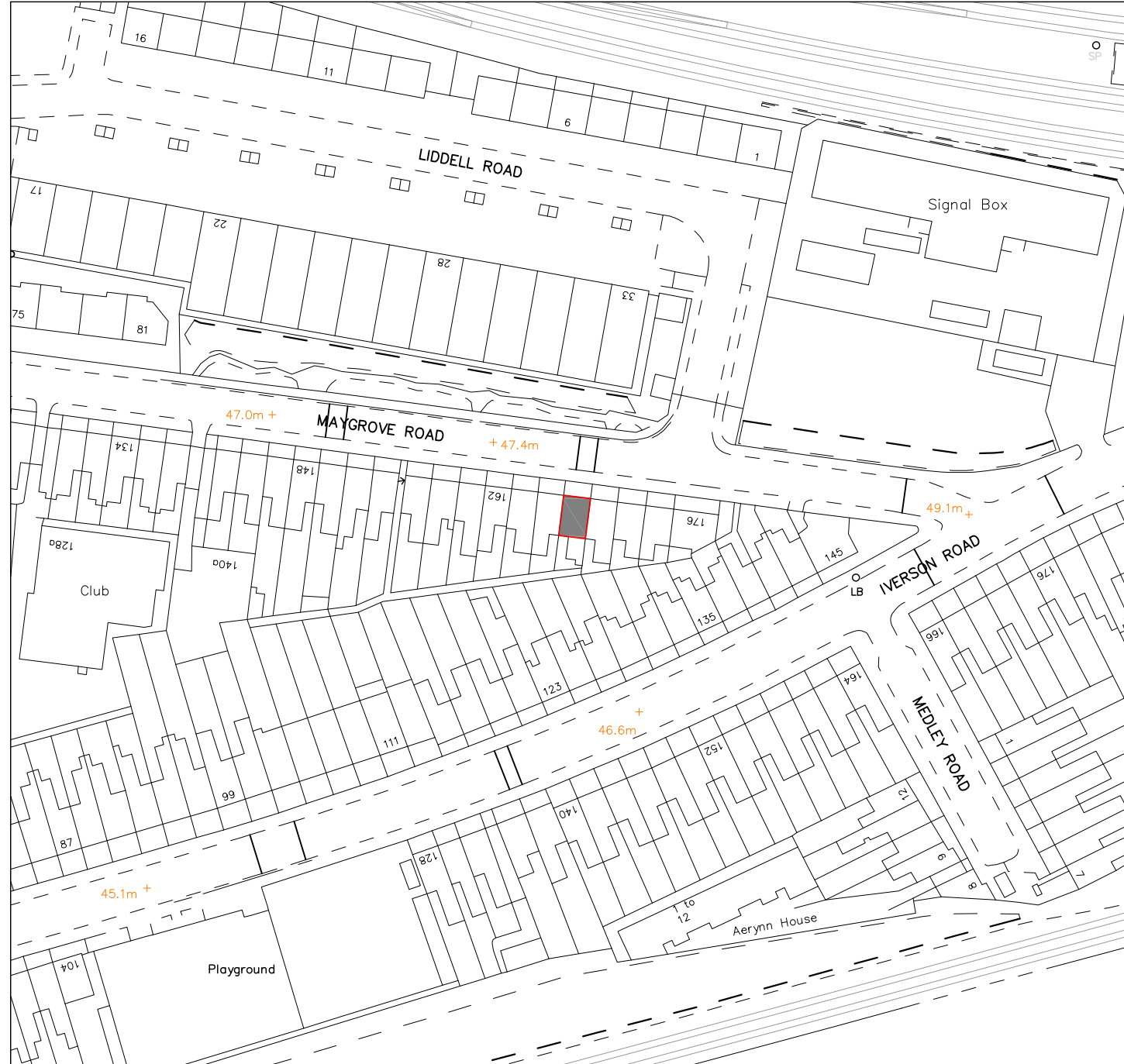
A01 SITE LOCATION PLAN ORDNANCE SURVEY DATA