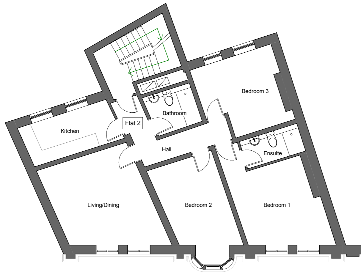
1 02 - Existing Second Floor Plan 1 : 100

NOTES -Do not scale from this drawing, except for planning purposes. -Check all dimensions on site. -Subject to survey. -Subject to site inspection. -Site boundary lines are indicative only.