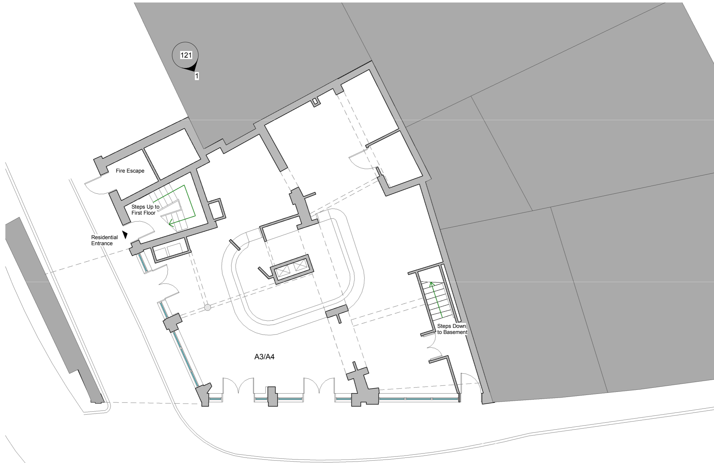
1 00 - Ground Floor Plan 1 : 100

NOTES -Do not scale from this drawing, except for planning purposes. -Check all dimensions on site. -Subject to survey. -Subject to site inspection. -Site boundary lines are indicative only.