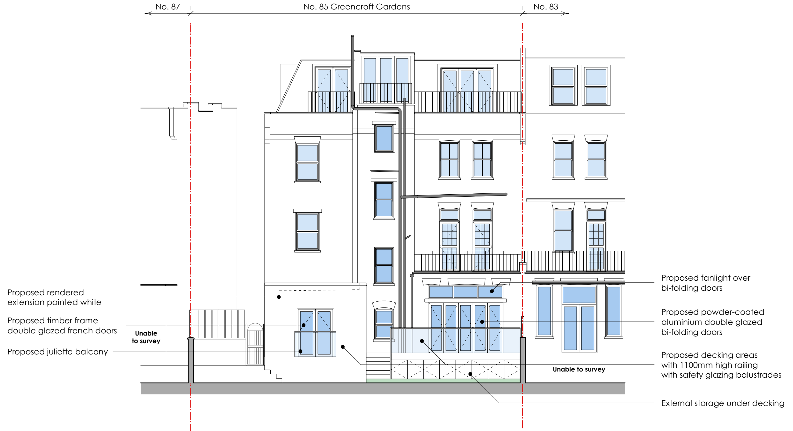
1 P-120 Proposed Rear Elevation scale 1:100 @ A3