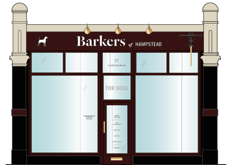
04 For Illustration Purposes Only n.t.s